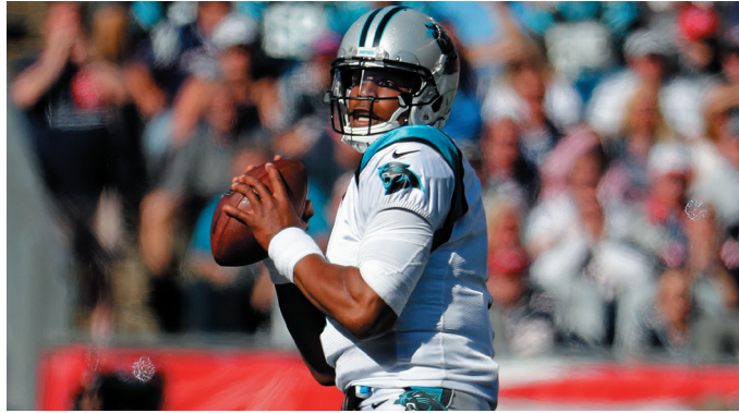
Quarterback Cam Newton threw for 316 yards and three touchdowns in Carolina's win at New England last season.