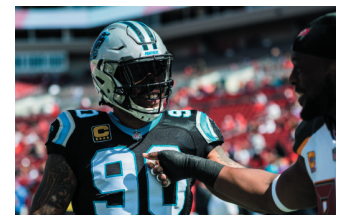
Three of the top four sack artists in NFL history played for the Panthers at one point in their career.