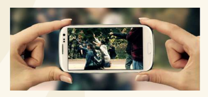
Turn your phone sideways to film