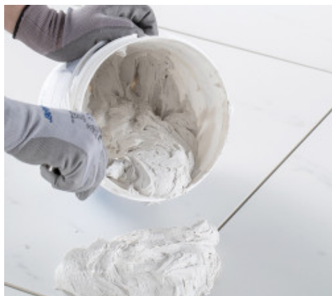
Obtain a creamy homogeneous mix