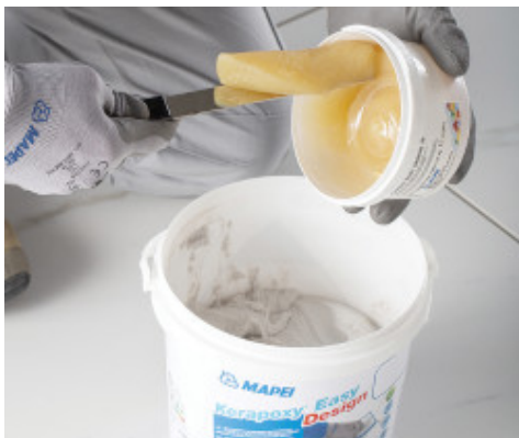
Pour the hardener (component B) in the container of component A