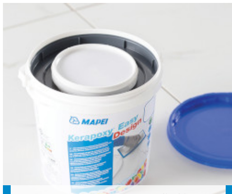
Two-component grout supplied in drums containing both component A and component B

After mixing the two components as described above, spread the adhesive on the substrate using a suitable notched trowel. Firmly press the tiles/mosaics into the adhesive bed to guarantee good adhesive transfer. Once set, the bond is extremely strong and resistant to chemical agents.