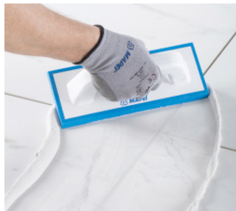
Easy-to-apply epoxy grout