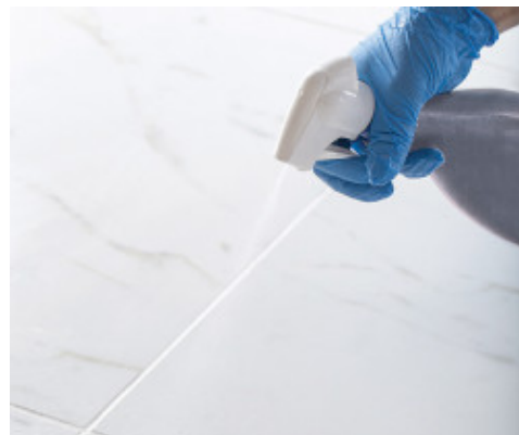
Possible final cleaning with UltraCare Kerapoxy Cleaner