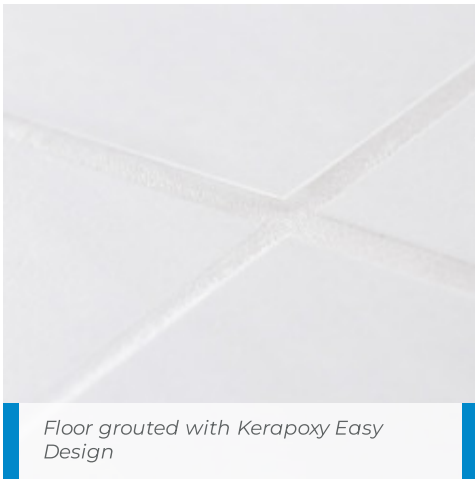
Floor grouted with Kerapoxy Easy Design