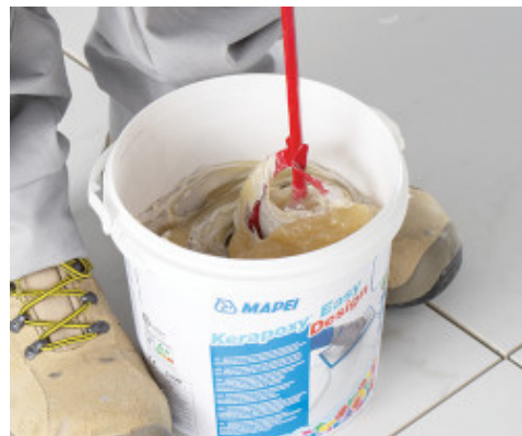
Mix the components (A+B)