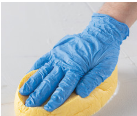
Easy cleaning and finishing with a cellulose sponge