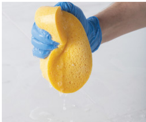
Clean with water while the product is still "fresh"