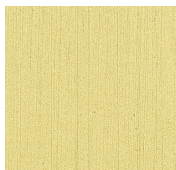
Ottone satinato Satin brass