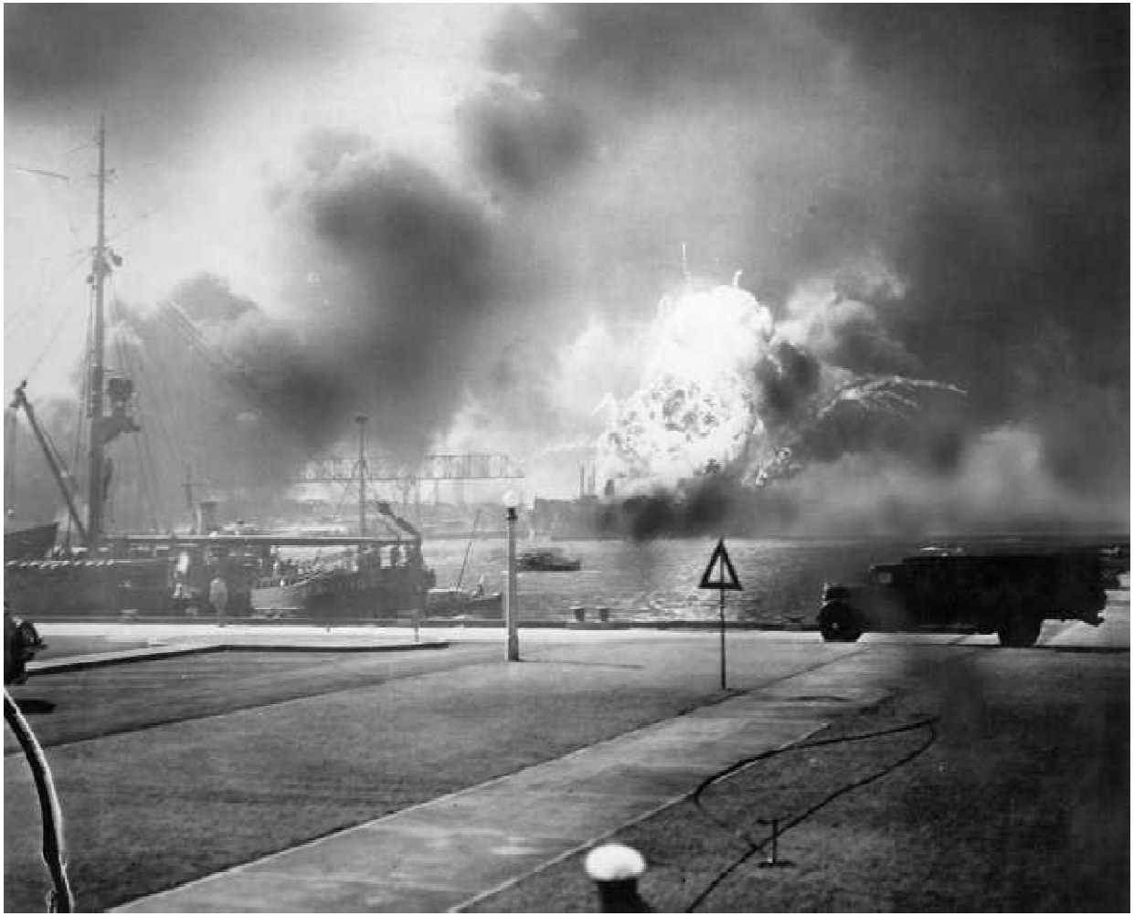
The Shaw as her magazine explodes.