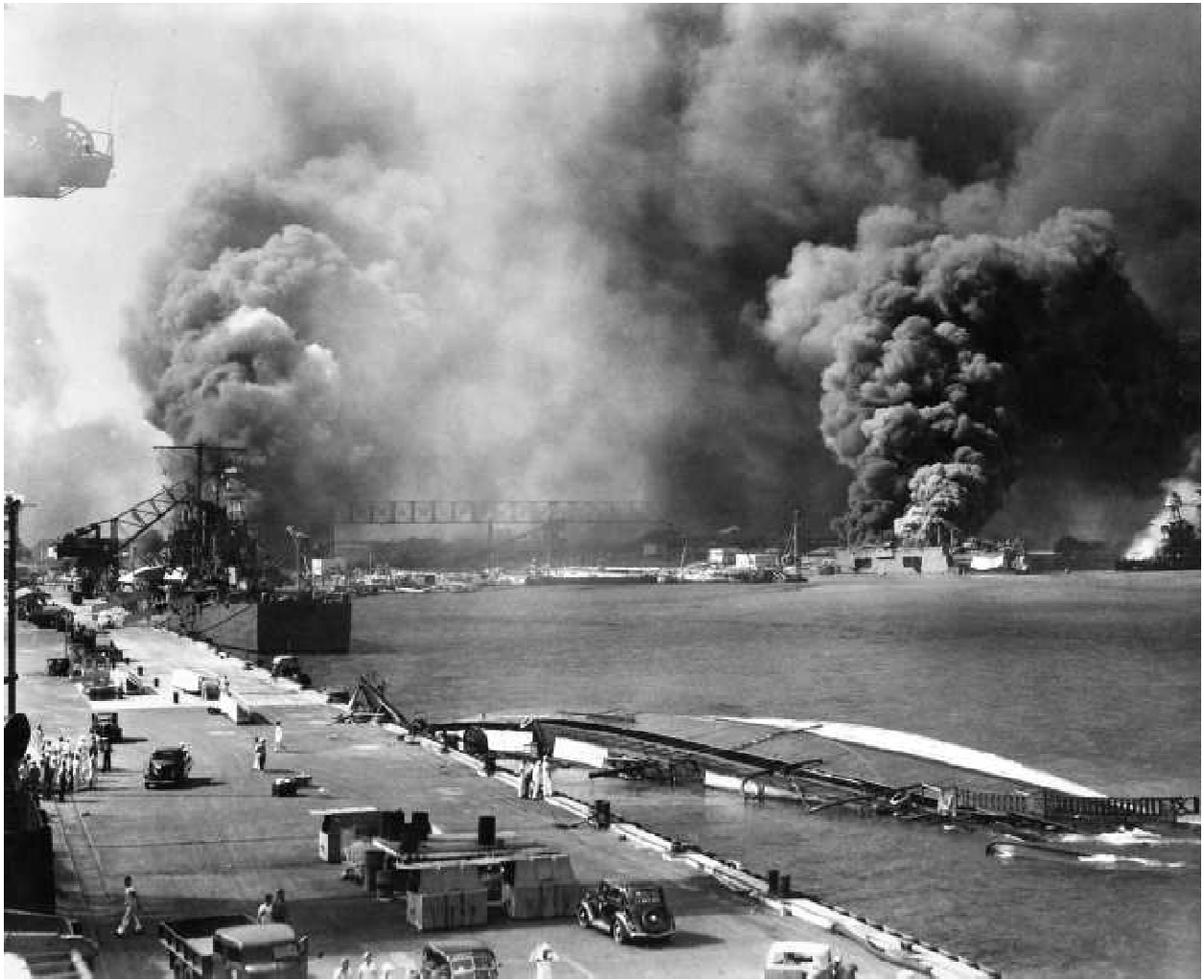
View of Battleship Row on fire. Capsized minelayer Ogala in foreground.