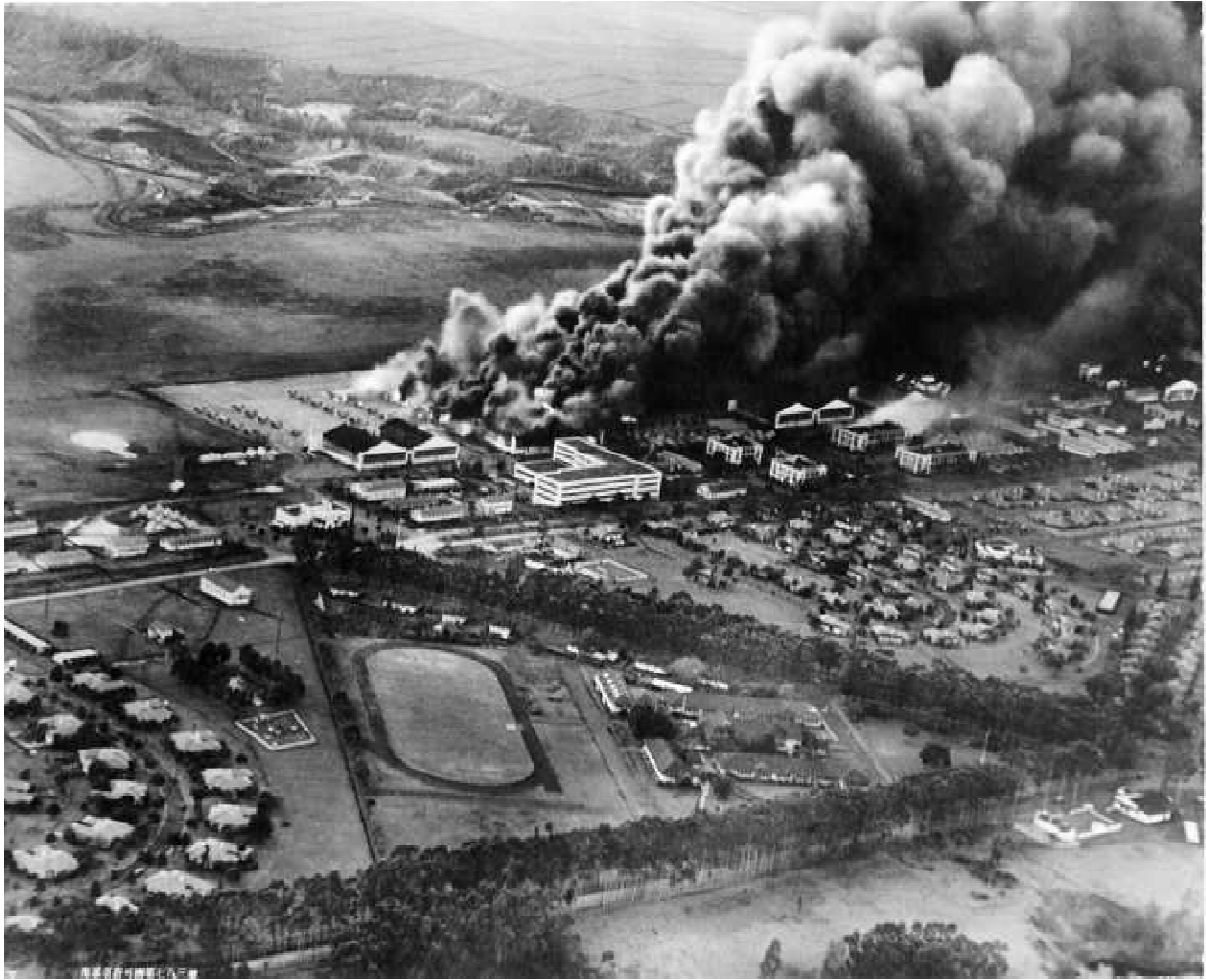
The U. S. Hawaiian Air Base at Wheeler Airfield. The hangars on the leeward side have burst into flames after being bombed. The rows of planes have not yet been destroyed by bombing.

National Archives # 80 G 30555 (A Captured Japanese Photo)