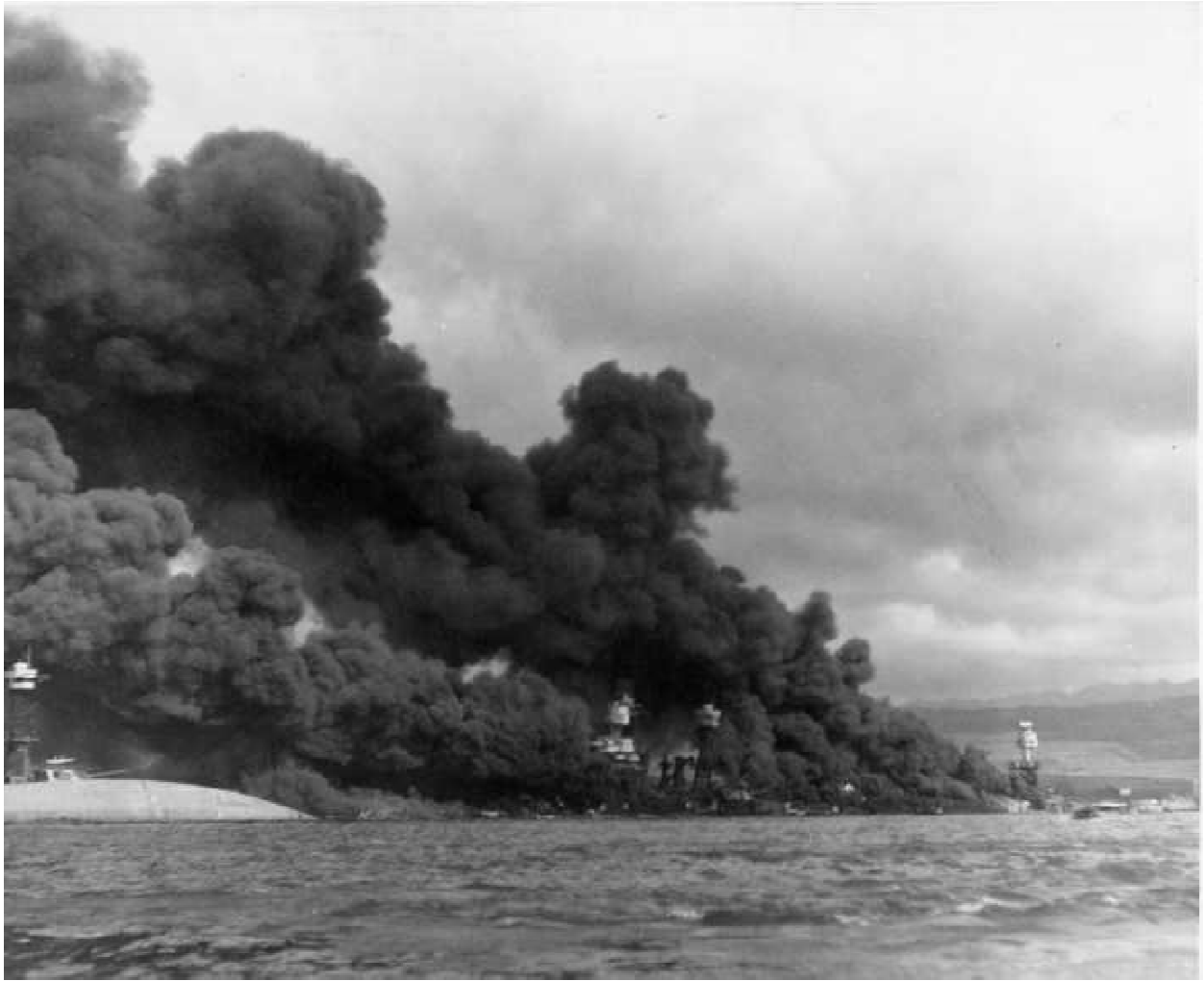
View of Battleship Row on fire. The Tennessee and West Virginia are in the center of the photo. The capsized battleship Oklahoma is at the left.