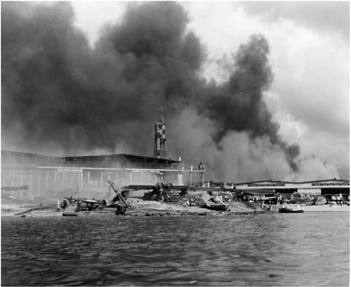
Wreckage at the Naval Air Station. The Arizona is in the background, shortly after her forward magazines exploded.