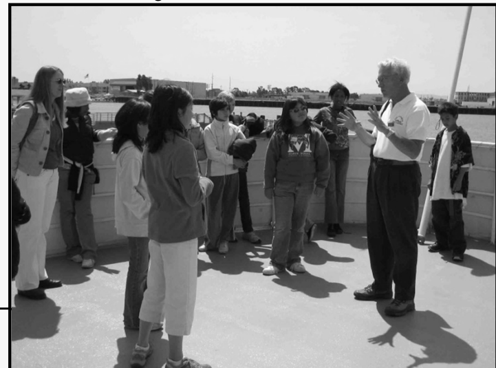
Learning about FDR and the Potomac