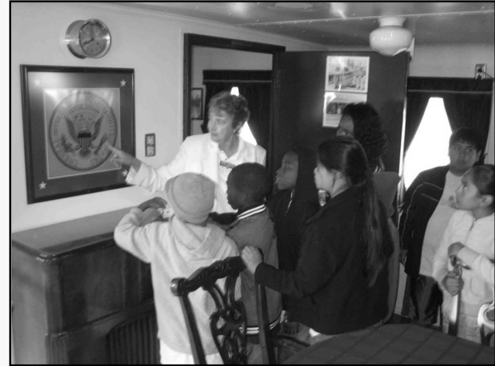
Learning about the Presidential Seal