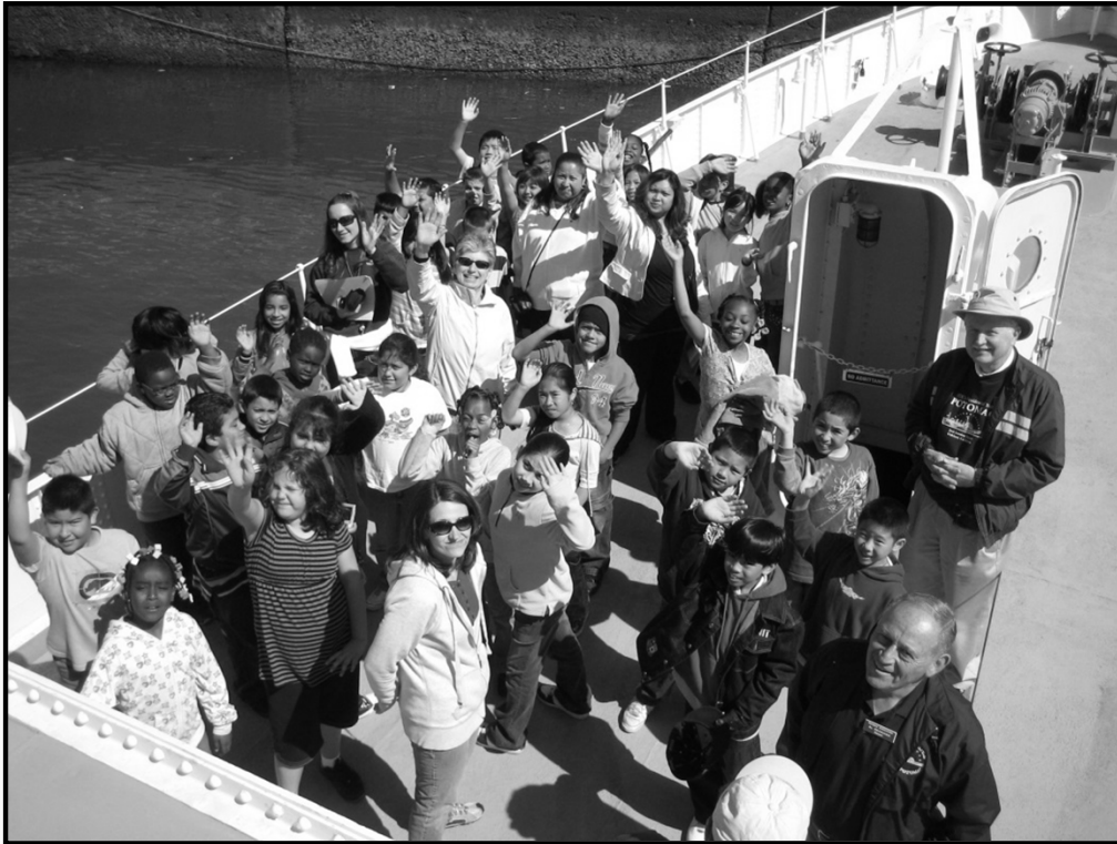
Education is our Mission. Students and volunteers off on an educational experience.