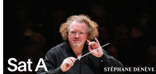
Sat A STÉPHANE DENÈVE

✦ SATURDAY, SEPTEMBER 20 Gustavo Dudamel conductor BEETHOVEN Symphony No. 5 John CORIGLIANO Symphony No. 1