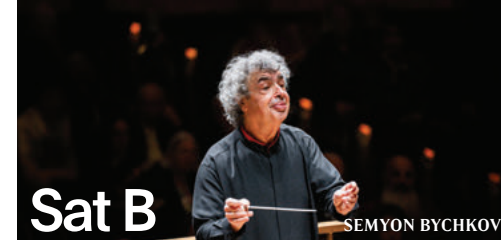
Sat B SEMYON BYCHKOV