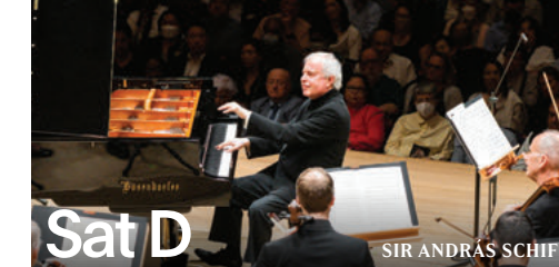
Sat D SIR ANDRÁS SCHIFF

▲ SATURDAY, OCTOBER 4 Esa-Pekka Salonen conductor Pierre-Laurent Aimard piano BOULEZ Selections from Notations DEBUSSY Gigues and Rondes de Printemps , from Images DEBUSSY Fantaisie for Piano and Orchestra DEBUSSY La Mer