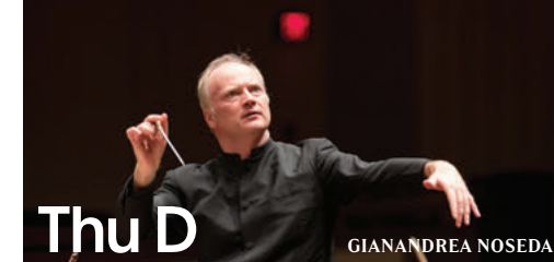
Thu D GIANANDREA NOSEDA

Price Level A | Price Level B | Price Level C | Price Level D