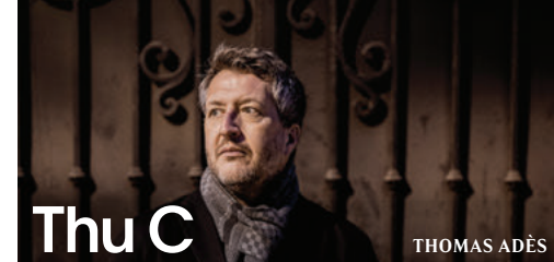
Thu C THOMAS ADÈS

NYPHIL.ORG 212.875.5656 *unless otherwise noted