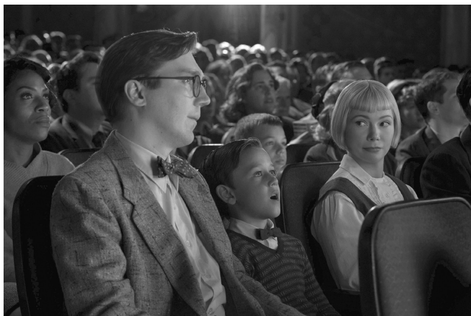
A scene from The Fabelmans, John Williams's recent collaboration with director Steven Spielberg