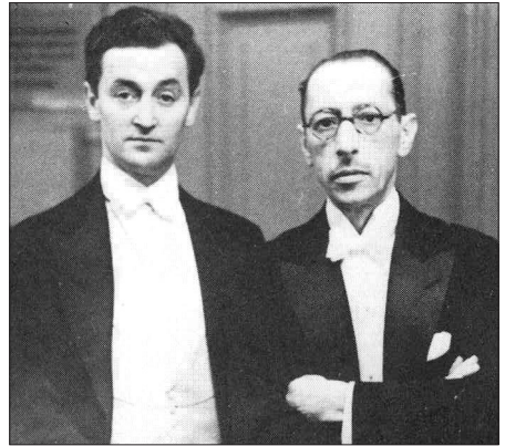
Violinist Samuel Dushkin and composer Igor Stravinsky during intermission at the world premiere of the composer’s Violin Concerto

In mathematics there are an infinite number of ways of arriving at the number seven. It’s the same with rhythm. The difference is that ... in mathematics the sum is the important thing; it makes no difference if you say five and two or two and five, six and one or one and six, and so on. With rhythm, however, the fact that they add up to seven is of secondary importance. The important thing is, is it five and two or is it two and five, because five and two is a different person from two and five.