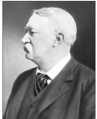
Symphonic rivals: conductors Leopold Damrosch (top) and Theodore Thomas