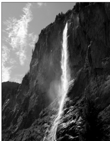
Staubbach Falls, just west of Lauterbrunnen, Switzerland

Schubert deploys the chorus in strikingly different ways throughout, which helps to delineate its structure. Initially they sing together, almost in a hushed monotone, but then Schubert uses the upper and lower voices antiphonally. The music mirrors closely the six stanzas of Goethe's poem — when we hear a dramatic shift in mood, tempo, dynamics, or another musical event, it signals the next stanza. Water, waves, and wind are central verbal themes that Schubert paints musically. The final stanza returns to the original tempo with the chugging double bass underneath and the same hushed choral incantation. The last lines, again mostly a monotone, are as simple as can be: "Human soul, / how similar you are to the water! / Human fate, / how similar you are to the wind!"