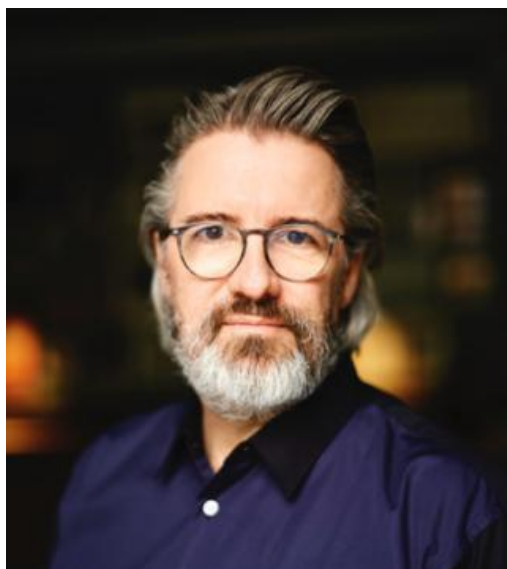
Olafur Eliasson.

Olafur Eliasson (Copenhagen, 1967, lives and works in Berlin) has, since the mid-1990s, carried out numerous and important exhibitions and projects all over the world. In 1995 he moved to Berlin, where he founded the Studio Olafur Eliasson, which today counts among its collaborators a large group of craftsmen, architects, archivists, researchers, administrators, cooks, programmers, art historians and specialized technicians.