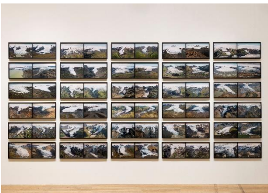
3 Olafur Eliasson, The glacier melt series 1999/2019 , 2019 Courtesy of the artist; neugerriemschneider, Berlin; Tanya Bonakdar Gallery, New York / Los Angeles © 2019 Olafur Eliasson Photo: Michael Waldrep / Studio Olafur Eliasson

Eliasson has photographed the Icelandic landscape for more than two decades. "The glacier melt series 1999/2019" (2019) is irrefutable proof of the changes in Iceland's glacier ice masses over the last 20 years.