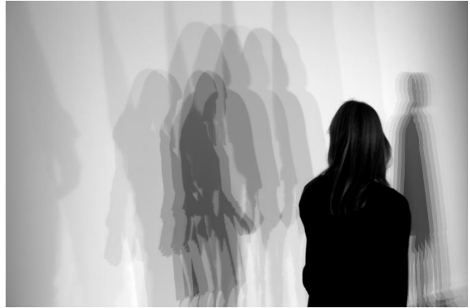
8 Olafur Eliasson, Slow-motion shadow, 2009 Installation view: 21st Century Museum of Contemporary Art, Kanazawa, Japan, 2009-2010