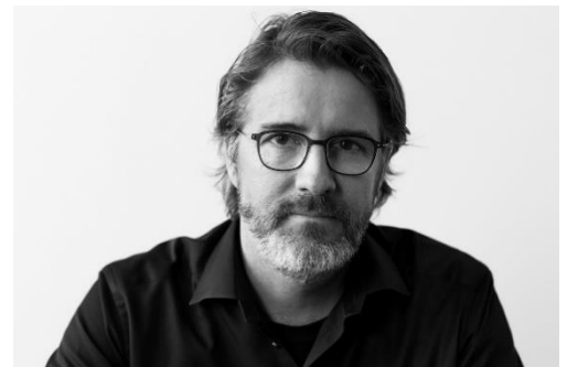
6 Portrait of Olafur Eliasson

Visit olafureliasson.net ; soe.tv ; studiootherspaces.net ; or littlesun.com or follow @olafureliasson on Twitter; @studiolafureliasson and @soe_kitchen on Instagram; and @studiolafureliasson on Facebook.