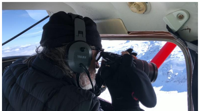
4 Olafur Eliasson photographing The glacier melt series 1999/2019 , 2019 in Reyjavik.