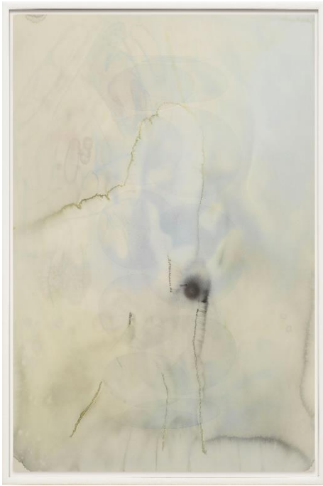
7 Olafur Eliasson, Methane matter, 2019 Courtesy of the artist; neugerriemschneider, Berlin; Tanya Bonakdar Gallery, New York / Los Angeles