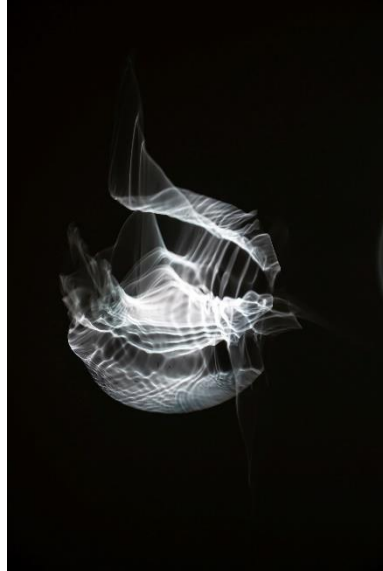
2 Test for new work for Olafur Eliasson: Sometimes the river is the bridge, 2019