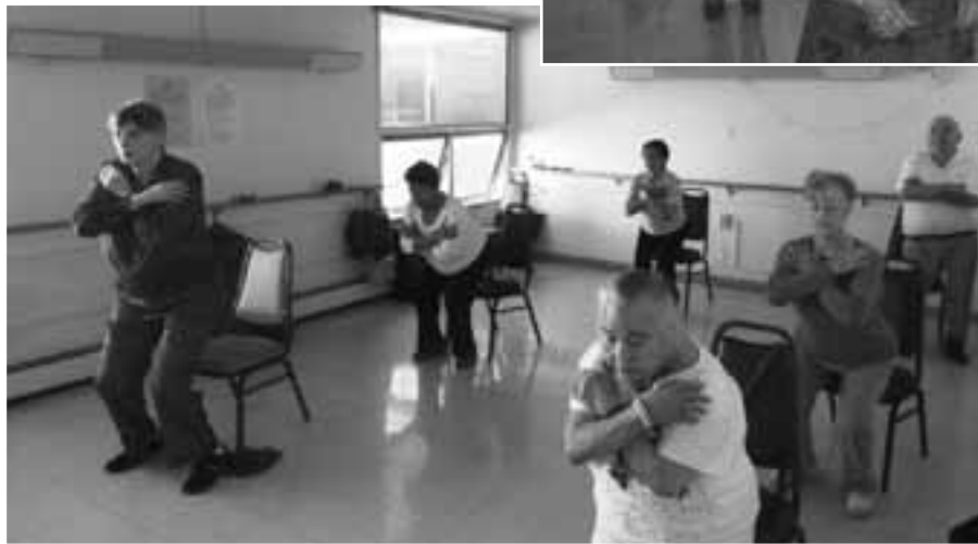
An exercise class as part of the Always Active Program offered city-wide.