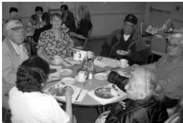
Although the aging process affects people differently, everyone benefits from a nutritious, healthy diet. The Center's dining room offers a warm lunch served in a beautiful dining setting and a friendly environment.