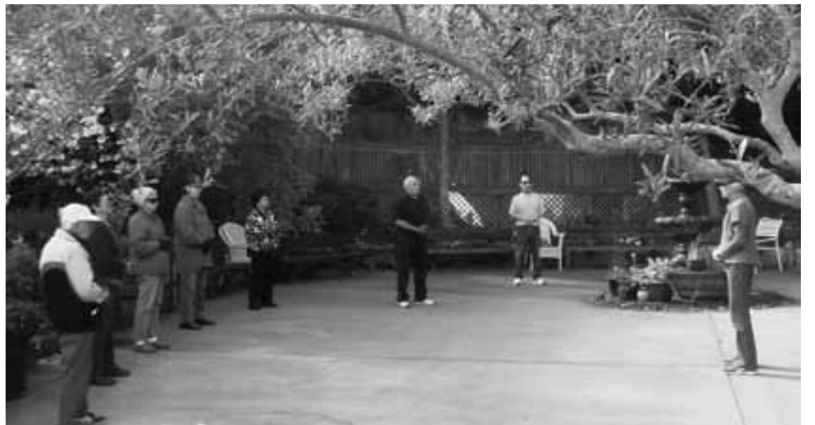
Seniors warm up before their Tai Chi Chuan class in the Center's garden on a Friday morning.