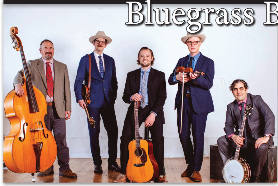
Meander Weekend Concert

Saturday, September 30, 2023 – 7:00 p.m.