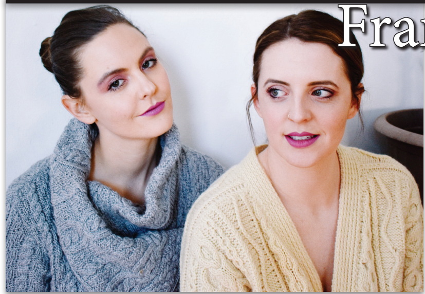
Light food and beverages available for purchase prior to the performance.