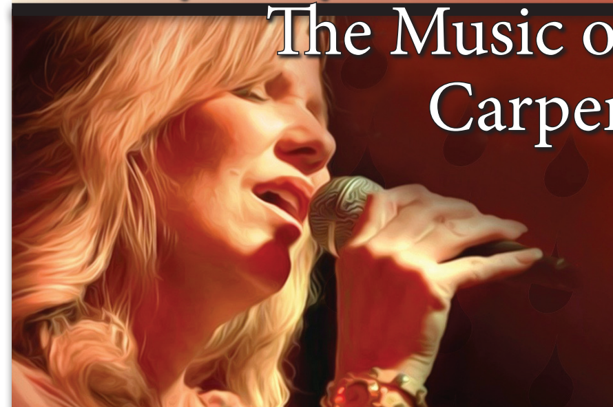
Enjoy a visual art exhibit in the lobby. Riverfest Weekend Concert