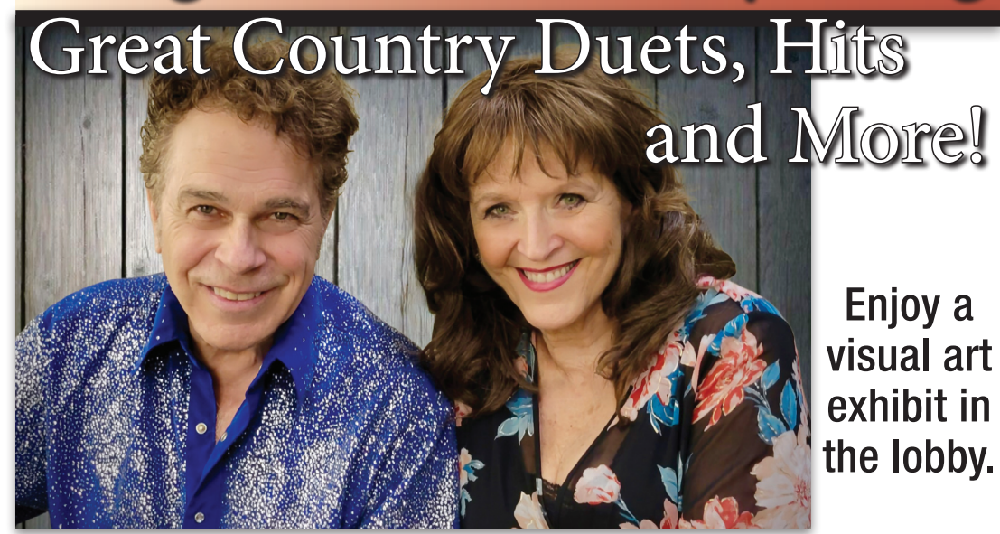
Enjoy a visual art exhibit in the lobby.