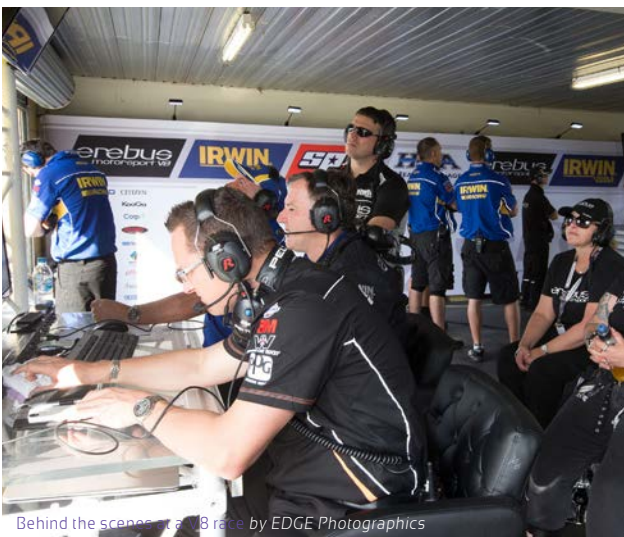
Behind the scenes at a V8 race