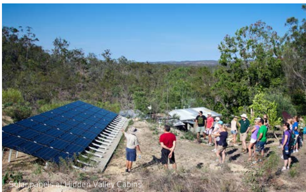
Solar panels at Hidden Valley Cabins