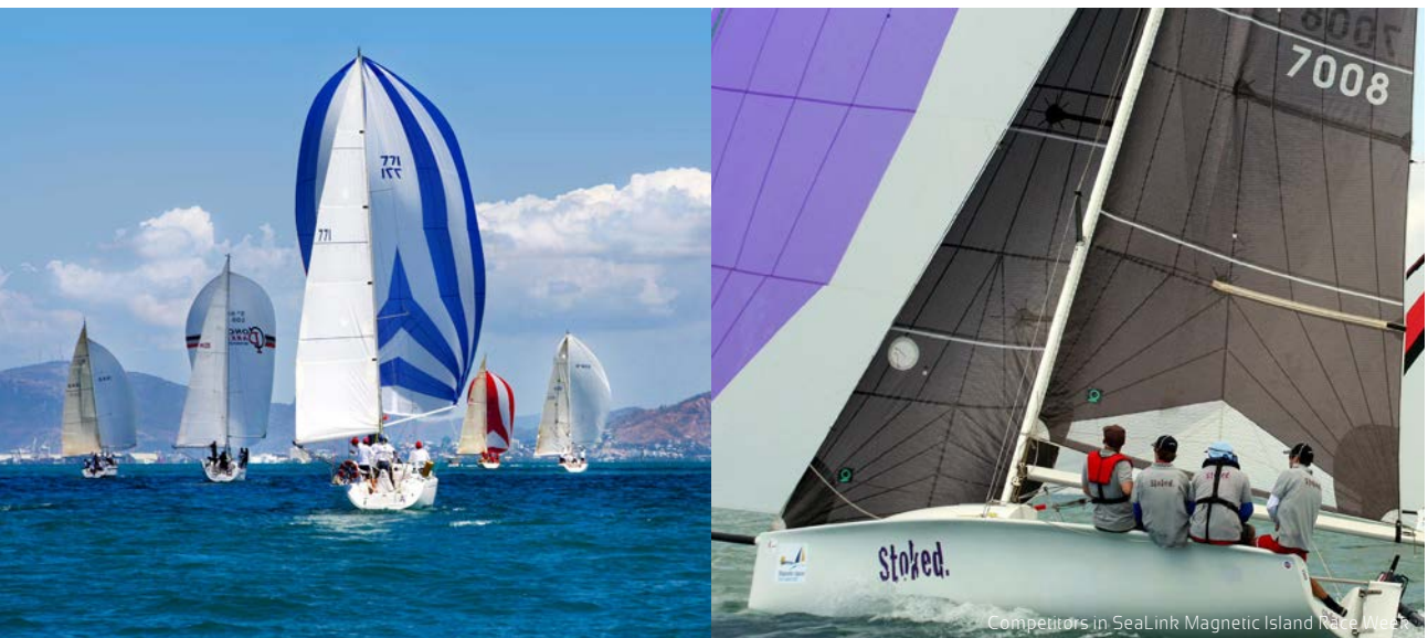
Competitors in SeaLink Magnetic Island Race Week