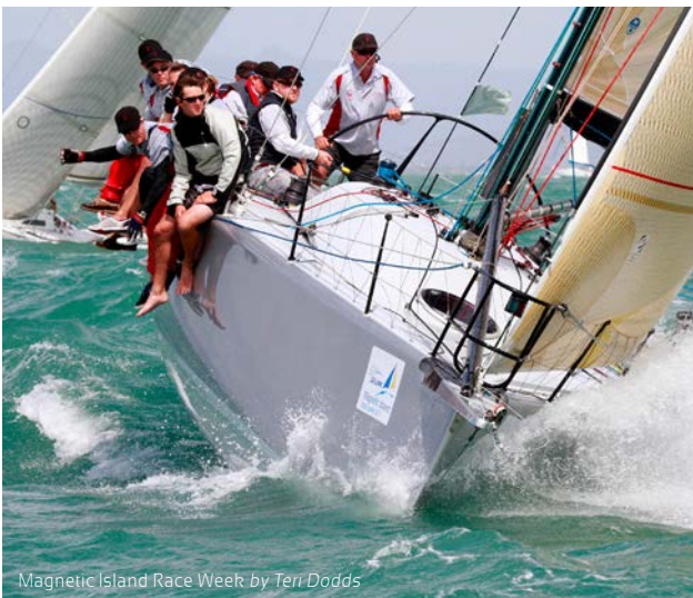
Magnetic Island Race Week

Townsville is home to exciting events held throughout the year, from festivals, markets, sporting events to exhibitions where you can treat your guests to an 'access all areas' experience. Between April and November you can meet a professional bull rider, go into pit lane at a Supercar race and meet a professional driver, or be part of a fashion shoot and discover what really happens behind the catwalk. Give your delegates an 'access all areas' events experience.