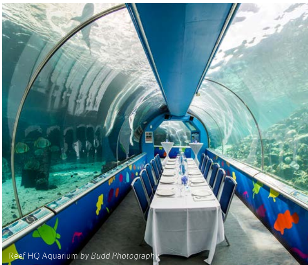
Reef HQ Aquarium

Blessed with an abundance of wildlife, five different landscapes within an hour's drive from the city hub of Townsville, and a team of people who have devoted their lives to caring for both, the Townsville North Queensland region provides the ultimate base for a face to face natural encounter. Interact with Australia's cutest creatures and immerse yourself in a tropical rainforest, the Great Barrier Reef and experience the rich culture and history of the Aboriginal people.