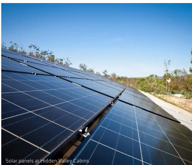
Solar panels at Hidden Valley Cabins