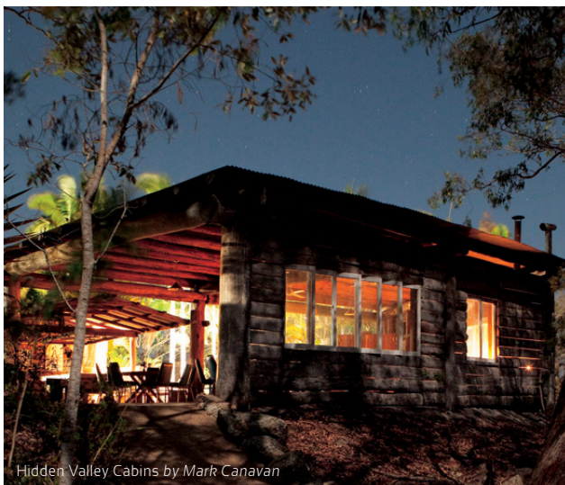
Hidden Valley Cabins