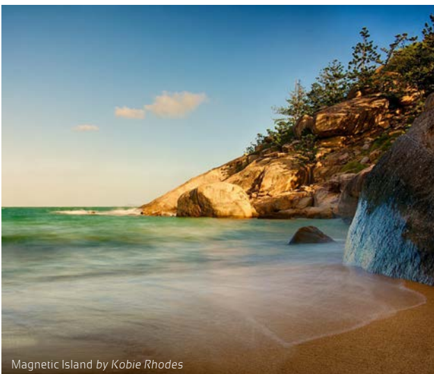
Magnetic Island by Kobie Rhodes