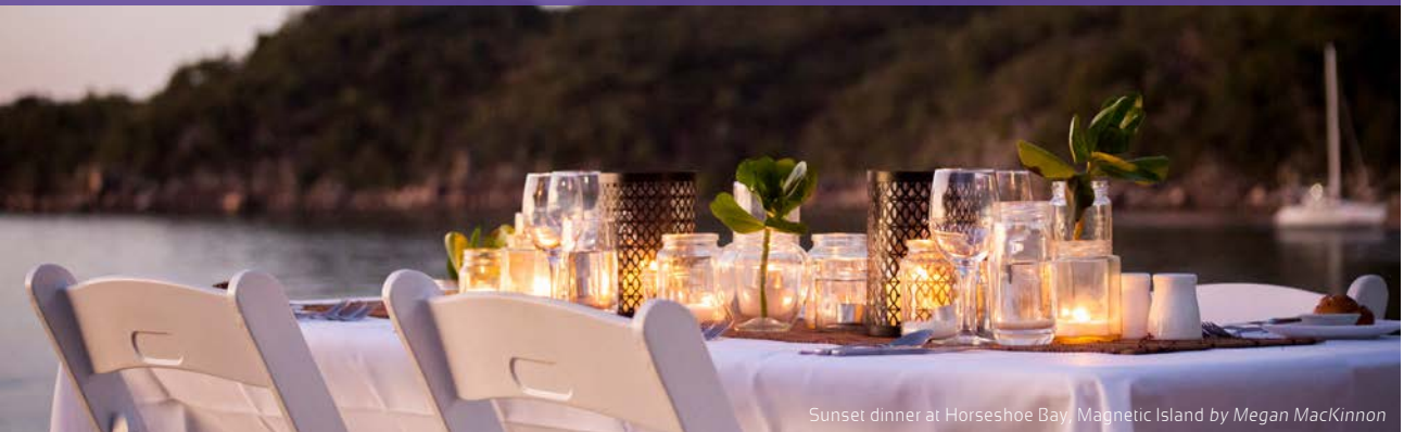
Sunset dinner at Horseshoe Bay, Magnetic Island by Megan MacKinnon

'We were blown away by the amazing setting for our candlelight dinner on the beach; outstanding wine-matched 3-course meal, and unsurpassed personal attention by staff.' – Delegate