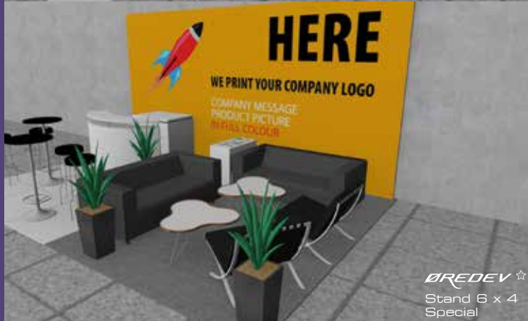
TOP OF THE ROCK BOOTH 6x4m height 4m With the furnitures you see in the drawing. Costs about 5000€