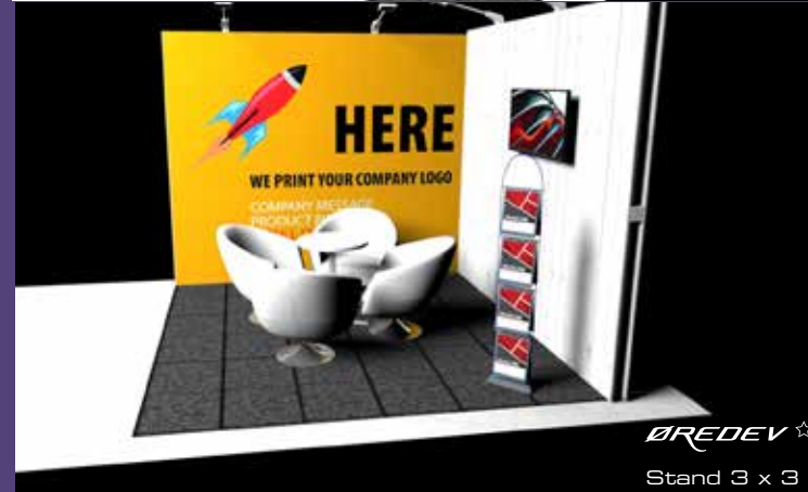
SPLASH BOOTH 3x3m height 2,5m With the furnitures you see in the drawing. Costs about 1700€