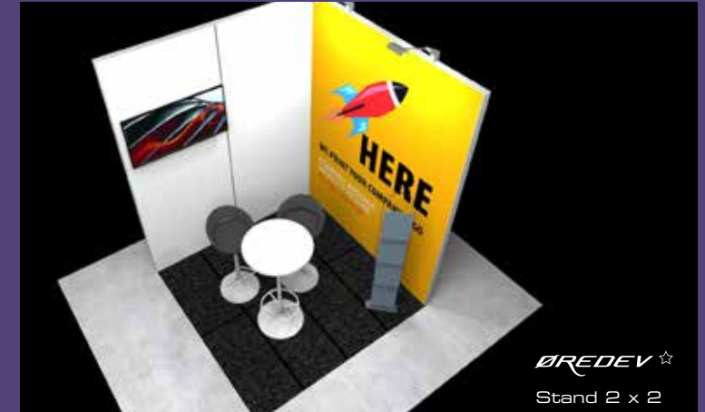
INTRO BOOTH 2x2m height 2,5m With the furnitures you see in the drawing. Costs about 1200€