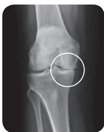
Knee OA without bracing (bone-on-bone contact)

Unloader braces unload the affected, painful side of the knee using a 3-Point Leverage System. The thigh and calf shells account for two points of leverage, while the Dynamic Force Strap (the diagonal strap above the knee) provides the third. This system “unloads” the pressure from the affected area, providing a reduction in pain.