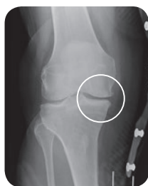
Knee OA with bracing (space created between bones)