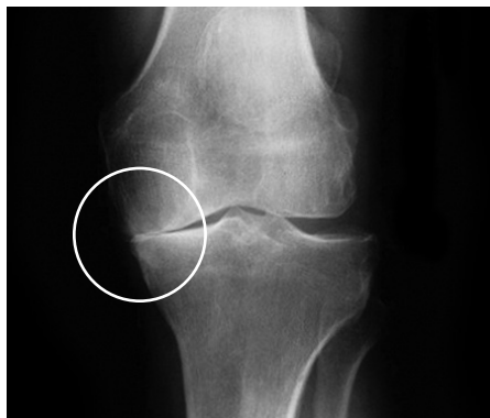
Medial compartment OA of the left knee

narrowed and the bones are rubbing together. Your doctor may refer to this as “bone-on-bone” contact.