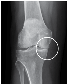
Knee OA without bracing (bone-on-bone contact)

The biomechanical change in the knee is demonstrated by the x-rays below.