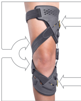
The 3-Point Leverage System (Unloader One® X shown)