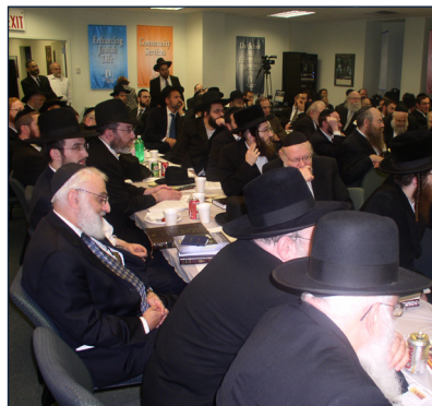
Large gathering of representatives from kashrus organizations