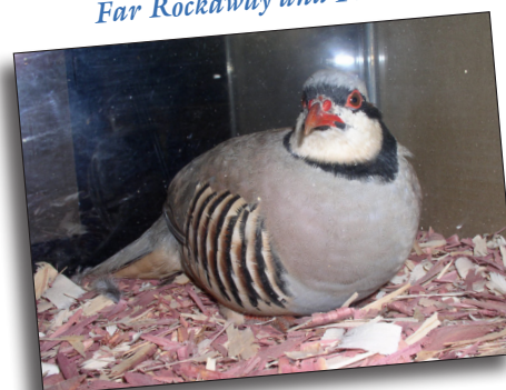
The Mesorah of the Kosher Partridge