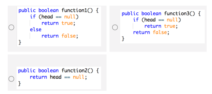
Fig. 2. Sample readability/style question: returning a boolean value with an operator (==). The Readability prompt was: "All of these code samples do the same thing. Which one is most readable to you: which one makes it easiest for YOU to figure out what the code does?" The Style question immediately followed the Readability question, with this prompt: "These are the same code samples as the previous question. All of these code samples do the same thing. Which one would an expert say has the best style? Style is the tasteful use of language that makes code elegant, efficient, and revealing of design intent." The Style questions all had one additional option, "An expert would say they all have equal style".

All code samples on the survey which demonstrated novice patterns were closely based on real novice code submitted as homework at either Institution A or B. All code samples were between 3 and 18 lines. Within each topic, variable names and typographic conventions (e.g., whitespace and placement of brackets) was kept consistent. Novice and Expert patterns on the comprehension questions were tightly matched to those on the readability/style questions.