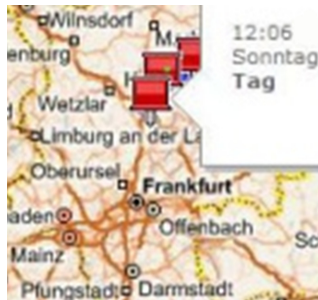
Figure 3. ContextDrive GeoTrace : Personal geographic traces are shown on a map. In the depicted case, the pins represent locations, where a user took pictures. Indicating a geographic area on the interactive map, a user can employ it as entry point into the personal experience trace. This facilitates queries such as “Show me, what I did north of Frankfurt, e.g., last Sunday”.

developed in C#, using the MS CCR&DSS Toolkit, and running on Windows. Zeitgeist [8] is a Linux open-source framework implemented in Python, with the purpose of deployment (e.g., candidate for the next GNOME release). It features a very light and performant engine, which exposes a Dbus API as well as alternative Dbus interfaces for extensions, which reside within the same process as the engine’s core logic.