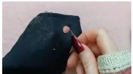
A hole to be darned in the toe of these tights

Alternatively, you are welcome to bring along your own needle and thread etc, if you already have a well stocked sewing basket at home.