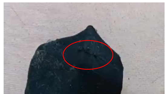
The newly darned tights - the hole is gone and the repair is flat and comfortable to wear