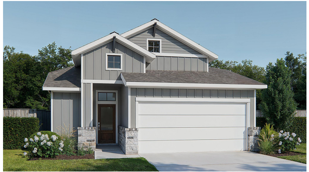
DESIGN 1778E E-30