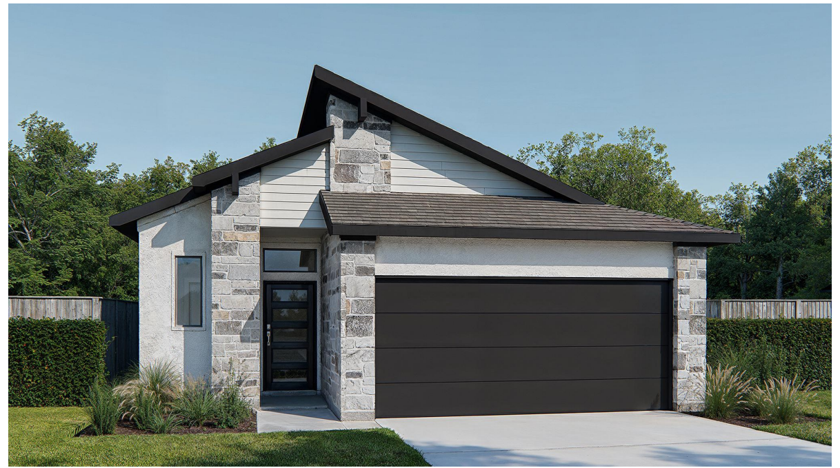
DESIGN 1778E E-1