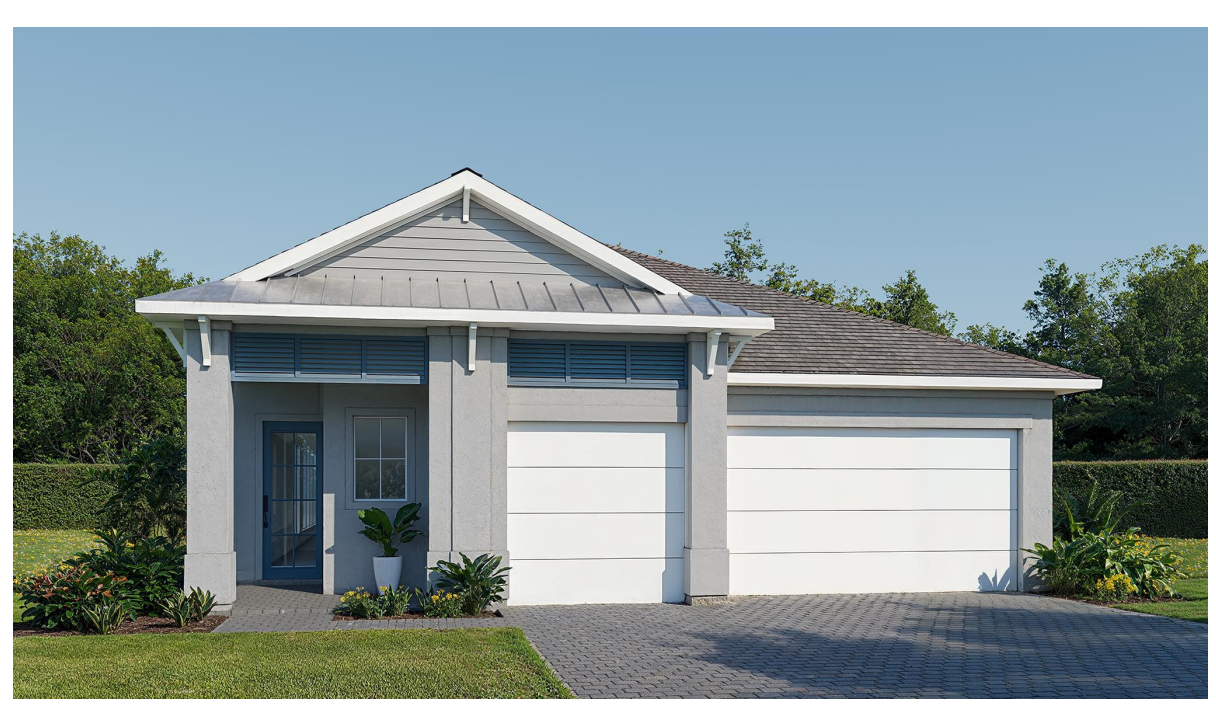
DESIGN 2262F E-50