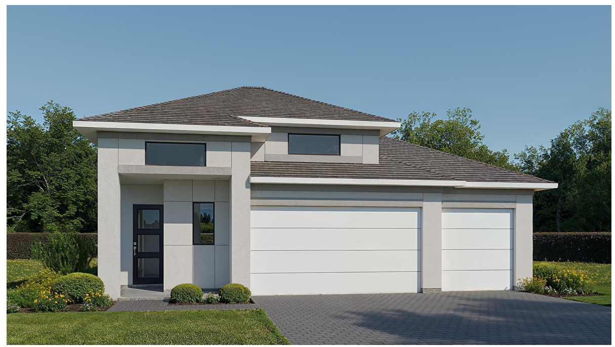
DESIGN 2262F E-1