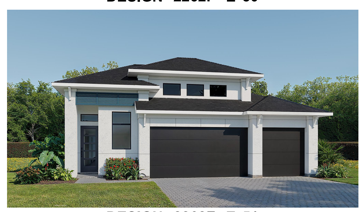
DESIGN 2262F E-51

This design, as originally designed and prior to any changes you make, is estimated to yield approximately the number of square feet shown on page 1. All dimensions are approximate. Square footage may vary based on as-built dimensions, configurations, plan options and/or the method of calculation. Designs are not-to-scale, and are conceptual illustrations that may differ from construction plans or completed improvements. A design may depict features not available on all homesites or in all communities. Perry Homes reserves the right to make changes in plans and specifications, and to substitute material of similar quality. Prices, terms, promotions, plans, dimensions, features, options, amenities, elevations, designs, square footages, specifications, materials, and availability of homes or communities are subject to change without notice or obligation. All obligations will be governed by a written contract. This design does not constitute a commitment to build a particular floor plan or home in any given community Some floor plans, options, and/or elevations may not be available on certain homesites or in a particular community and may require additional charges. Please check with Perry Homes to verify current offerings in the communities are considering. This rendering is the property of Perry Homes 11 C. Any reproduction or exhibition is strictly prohibited @ Perry Homes 11 C. 2025