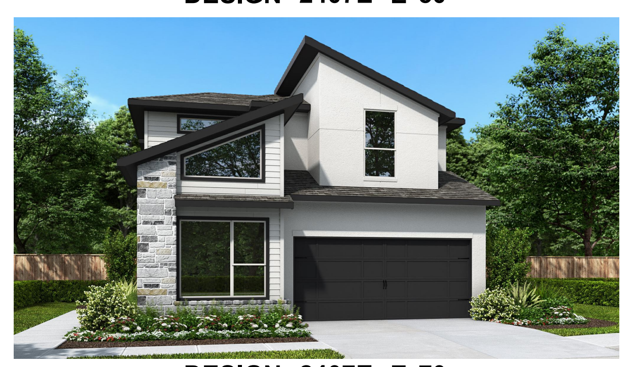
DESIGN 2407E E-70

This design, as originally designed and prior to any changes you make, is estimated to yield approximately the number of square feet shown on page 1. All dimensions are approximate. Square footage may vary based on as-built dimensions, configurations, plan options and/or the method of calculation. Designs are not-to-scale, and are conceptual illustrations that may differ from construction plans or completed improvements. A design may depict features not available on all homesites or in all communities. Perry Homes reserves the right to make changes in plans and specifications, and to substitute material of similar quality. Prices, terms, promotions, plans, dimensions, features, options, amenities, elevations, designs, square footages, specifications, materials, and availability of homes or communities to change without notice or obligation. All obligations will be governed by a written contract. This design does not constitute a commitment to build a particular floor plan or home in any given community. Some floor plans, options, and/or elevations may not be available on certain homesites or in a particular community and may require additional charges. Please check with Perry Homes to verify current offerings in the communities and are considering. This rendering is the property of Perry Homes. LLC. Any reproduction or exhibition is strictly prohibited @ Perry Homes LLC. 2019.