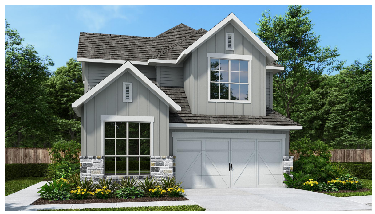
DESIGN 2407E E-1