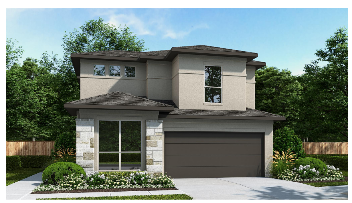
DESIGN 2407E E-50