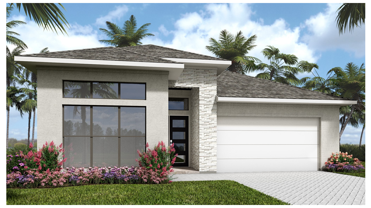
DESIGN 2517F E-1