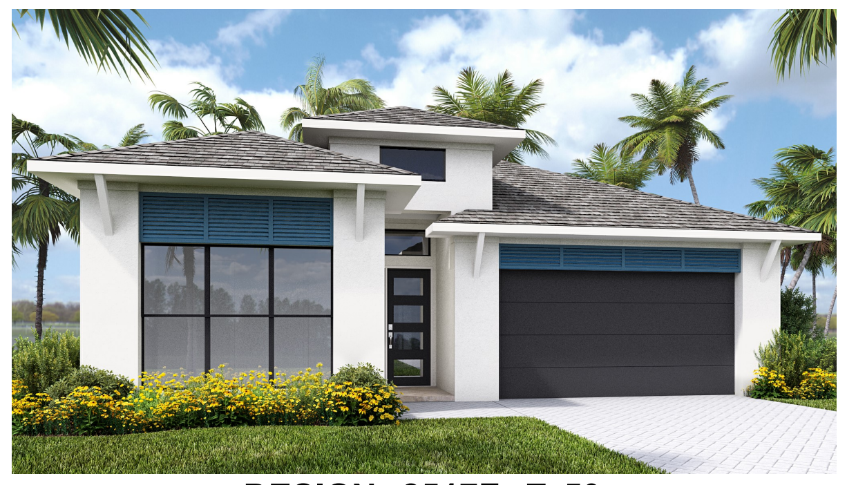
DESIGN 2517F E-50

This design, as originally designed and prior to any changes you make, is estimated to yield approximately the number of square feet shown on page 1. All dimensions are approximate. Square footage may vary based on as-built dimensions, configurations, plan options and/or the method of calculation. Designs are not-to-scale, and are conceptual illustrations that may differ from construction plans or completed improvements. A design may depict features not available on all homesites or in all communities. Perry Homes reserves the right to make changes in plans and specifications, and to substitute material of similar quality. Prices, terms, promotions, plans, dimensions, features, options, amenities, elevations, designs, square footages, specifications, materials, and availability of homes or communities to change without notice or obligation. All obligations will be governed by a written contract. This design does not constitute a commitment to build a particular floor plan or home in any given community. Some floor plans, options, and/or elevations may not be available on certain homesites or in a particular community and may require additional charges. Please check with Perry Homes to verify current offerings in the communities on are considering. This rendering is the property of Perry Homes. LLC. Any reproduction or exhibition is strictly prohibited @ Perry Homes LLC. 2019