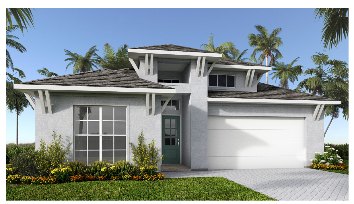
DESIGN 2517F E-30