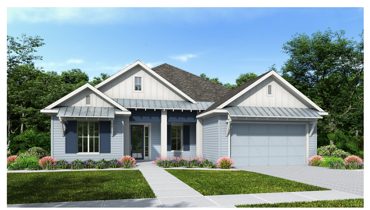
DESIGN 2547F E-1