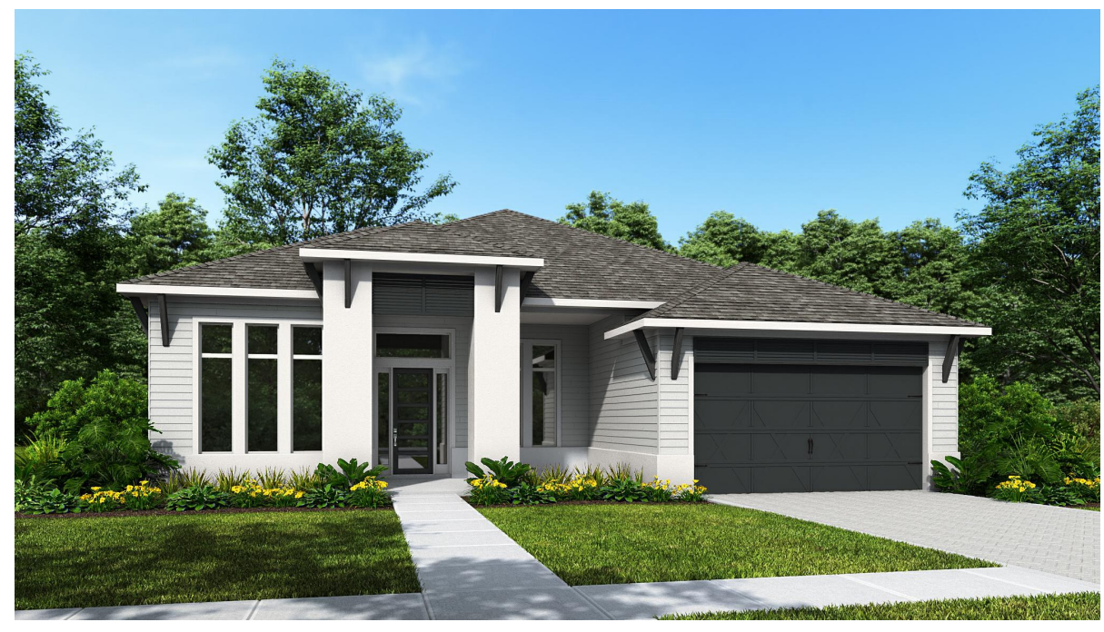
DESIGN 2547F E-3

This design, as originally designed and prior to any changes you make, is estimated to yield approximately the number of square feet shown on page 1. All dimensions are approximate. Square footage may vary based on as-built dimensions, configurations, plan options and/or the method of calculation. Designs are not-to-scale, and are conceptual illustrations that may differ from construction plans or completed improvements. A design may depict features not available on all homesites or in all communities. Perry Homes reserves the right to make changes in plans and specifications, and to substitute material of similar quality. Prices, terms, promotions, plans, dimensions, features, options, amenities, elevations, designs, square footages, specifications, materials, and availability of homes or communities are subject to change without notice or obligation. All obligations will be governed by a written contract. This design does not constitute a commitment to build a particular floor plan or home in any given community some floor plans, options, and/or elevations may not be available on certain homesites or in a particular community and may require additional charges. Please check with Perry Homes to verify current offerings in the communities you are considering. This rendering is the property of Perry Homes. LLC. Any reproduction or exhibition is strictly prohibited. © Perry Homes. LLC 2024