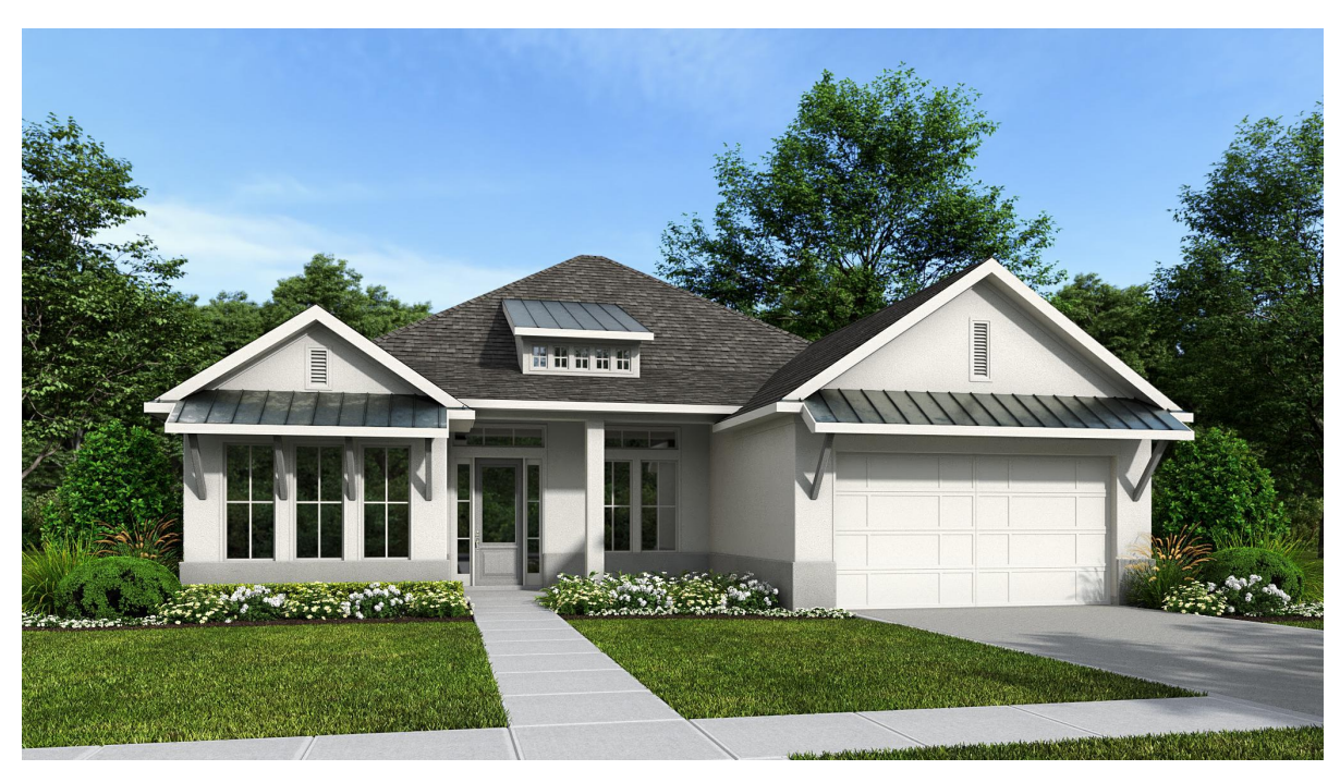
DESIGN 2547F E-2