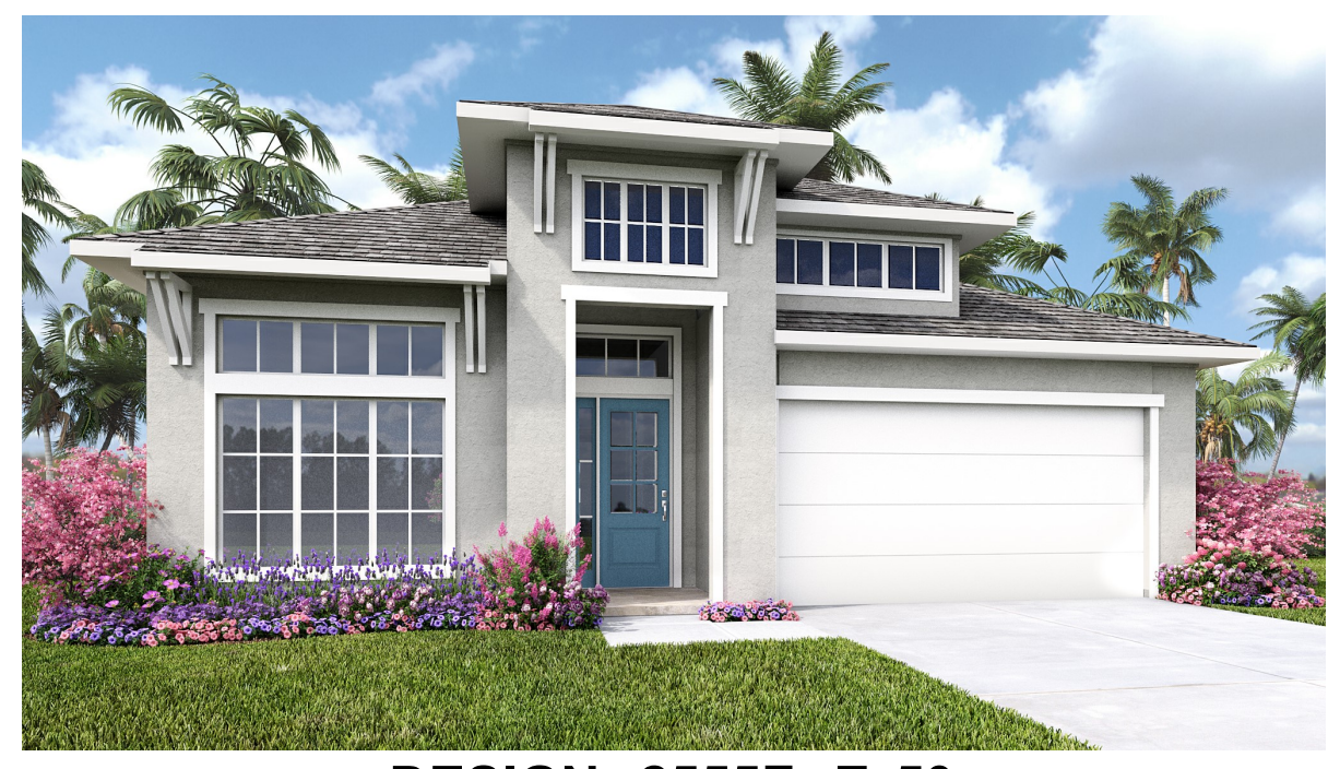
DESIGN 2555F E-50

This design, as originally designed and prior to any changes you make, is estimated to yield approximately the number of square feet shown on page 1. All dimensions are approximate. Square footage may vary based on as-built dimensions, configurations, plan options and/or the method of calculation. Designs are not-to-scale, and are conceptual illustrations that may differ from construction plans or completed improvements. A design may depict features not available on all homesites or in all communities. Perry Homes reserves the right to make changes in plans and specifications, and to substitute material of similar quality. Prices, terms, promotions, plans, dimensions, features, options, amenities, elevations, designs, square footages, specifications, materials, and availability of homes or communities are subject to change without notice or obligation. All obligations will be governed by a written contract. This design does not constitute a commitment to build a particular floor plan or home in any given community Some floor plans, options, and/or elevations may not be available on certain homesites or in a particular community and may require additional charges. Please check with Perry Homes to verify current offerings in the communities are considering. This rendering is the property of Perry Homes II C. Any reproduction or exhibition is strictly prohibited @ Perry Homes II C. 2025