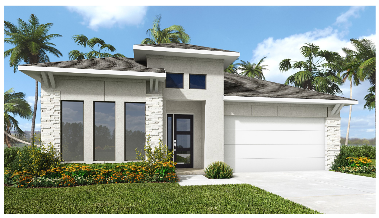
DESIGN 2555F E-30