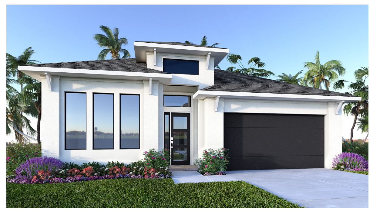
DESIGN 2555F E-1