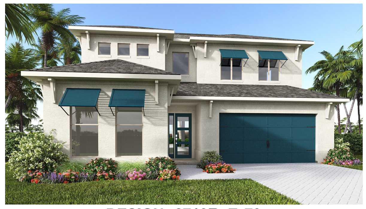
DESIGN 2713F E-70

This design, as originally designed and prior to any changes you make, is estimated to yield approximately the number of square feet shown on page 1. All dimensions are approximate. Square footage may vary based on as-built dimensions, configurations, plan options and/or the method of calculation. Designs are not-to-scale, and are conceptual illustrations that may differ from construction plans or completed improvements. A design may depict features not available on all homesites or in all communities. Perry Homes reserves the right to make changes in plans and specifications, and to substitute material of similar quality. Prices, terms, promotions, plans, dimensions, features, options, amenities, elevations, designs, square footages, specifications, materials, and availability of homes or communities to change without notice or obligation. All obligations will be governed by a written contract. This design does not constitute a commitment to build a particular floor plan or home in any given community. Some floor plans, options, and/or elevations may not be available on certain homesites or in a particular community and may require additional charges. Please check with Perry Homes to verify current offerings in the communities volume considering. This rendering is the property of Perry Homes. LLC. Any reproduction or exhibition is strictly prohibited (@ Perry Homes LLC. 2012).