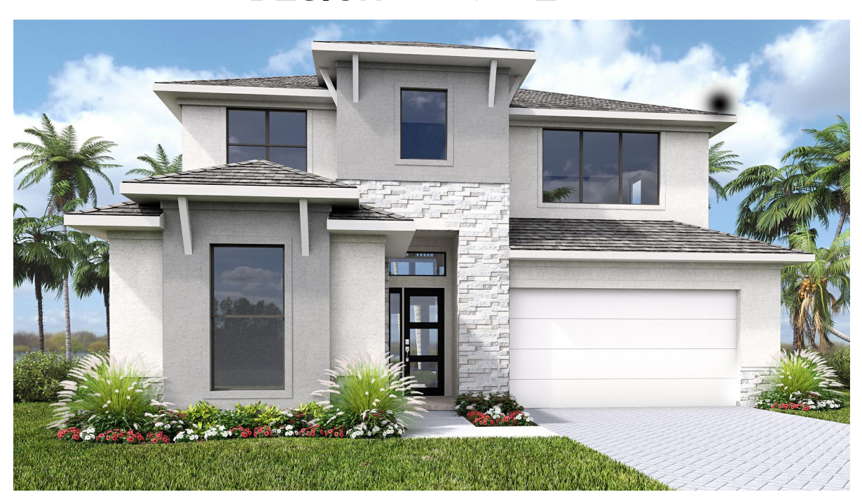
DESIGN 2713F E-50