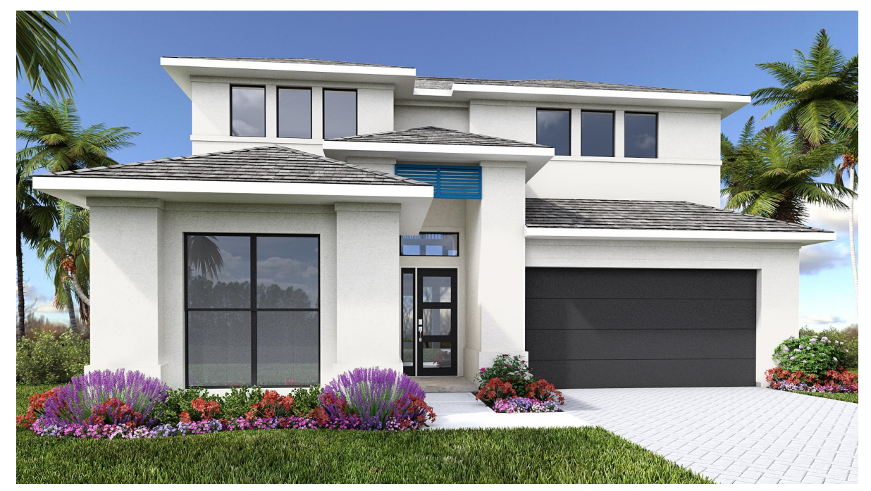
DESIGN 2713F E-1