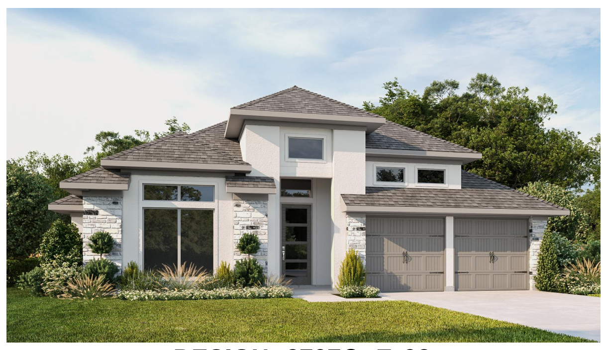
DESIGN 2737C E-32