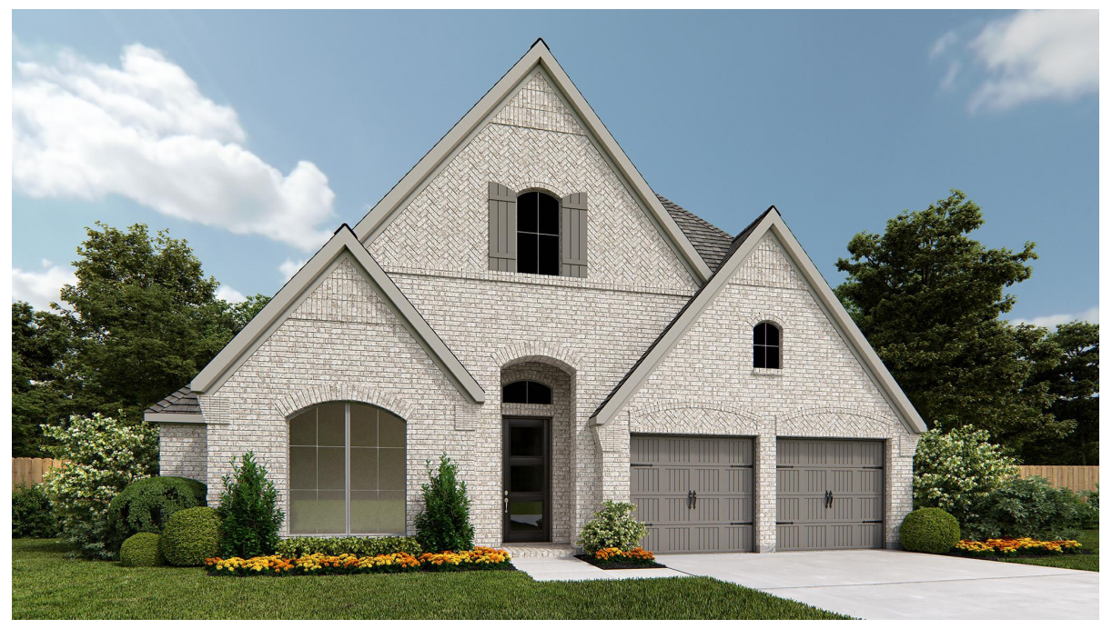
DESIGN 2737C E-1