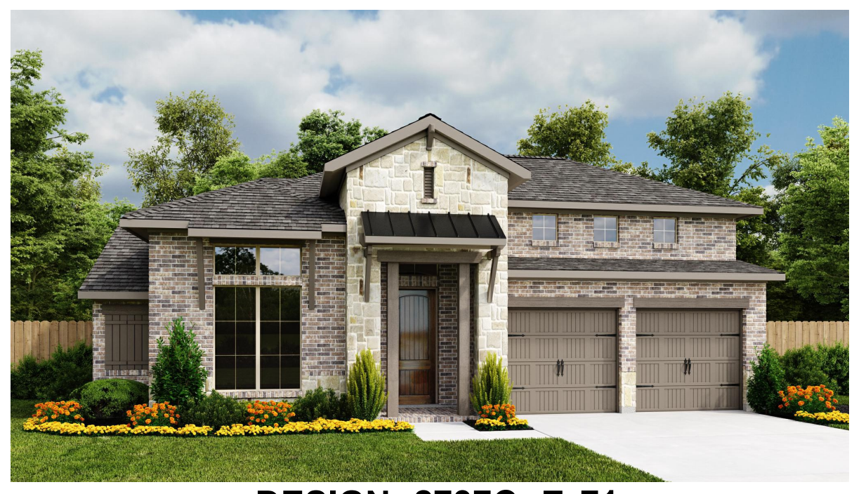
DESIGN 2737C E-71

This design, as originally designed and prior to any changes you make, is estimated to yield approximately the number of square feet shown on page 1. All dimensions are approximate. Square footage may vary based on as-built dimensions, configurations, plan options and/or the method of calculation. Designs are not-to-scale, and are conceptual illustrations that may differ from construction plans or completed improvements. A design may depict features not available on all homesites or in all communities. Perry Homes reserves the right to make changes in plans and specifications, and to substitute material of similar quality. Prices, terms, promotions, plans, dimensions, features, options, amenities, elevations, designs, square footages, specifications, materials, and availability of homes or communities are subject to change without notice or obligation. All obligations will be governed by a written contract. This design does not constitute a commitment to build a particular floor plan or home in any given community Some floor plans, options, and/or elevations may not be available on certain homesites or in a particular community and may require additional charges. Please check with Perry Homes to verify current offerings in the communities are considering. This rendering is the property of Perry Homes 11 C. Any reproduction or exhibition is strictly prohibited @ Perry Homes 11 C. 2025