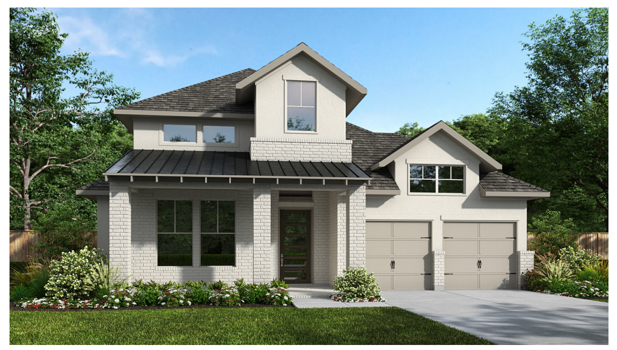
DESIGN 2737C E-33