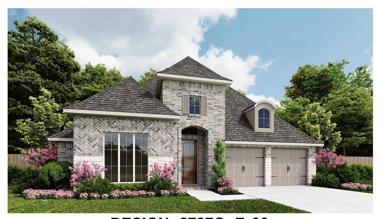
DESIGN 2737C E-30