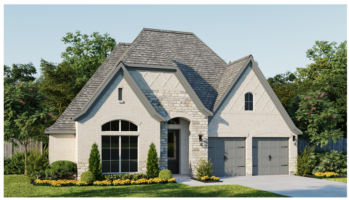
DESIGN 2737C E-50