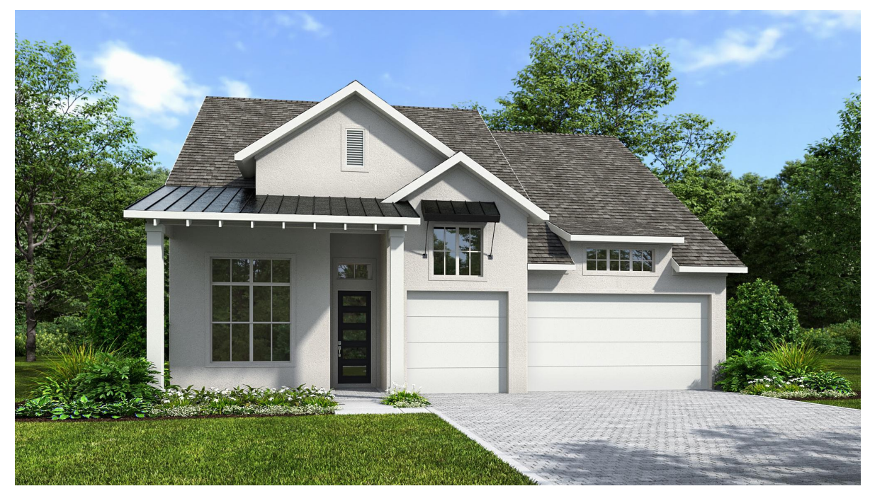
DESIGN 2749F E-100