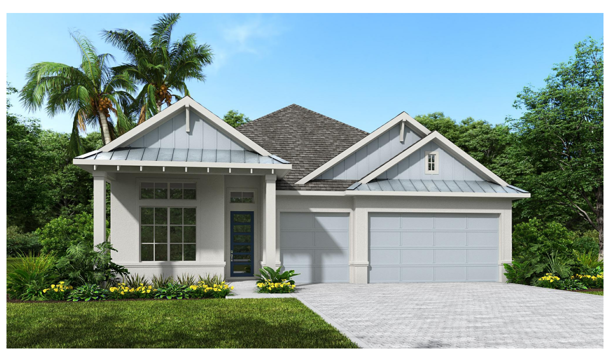
DESIGN 2749F E-101