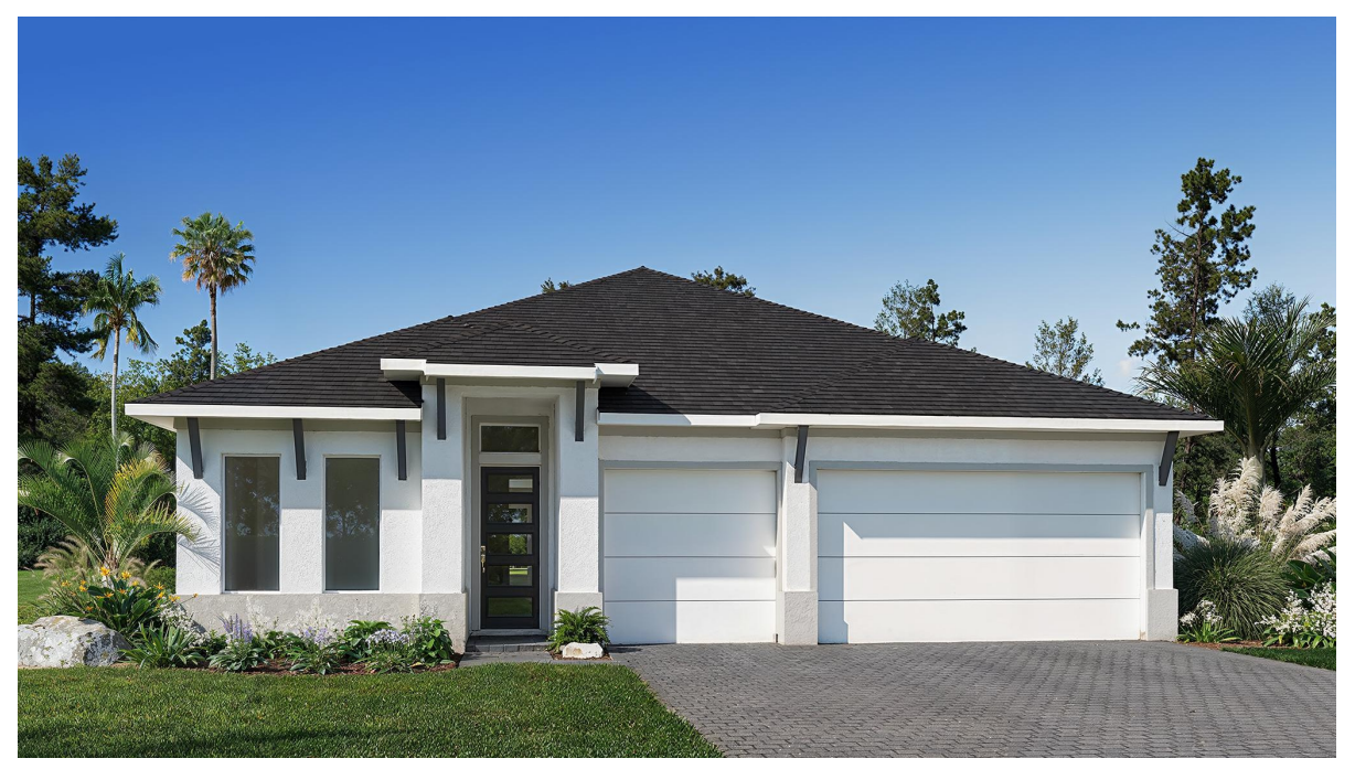
DESIGN 2749F E-1