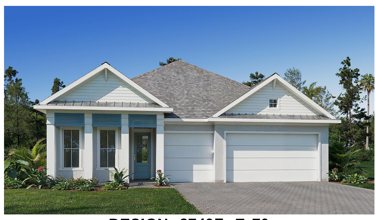
DESIGN 2749F E-70