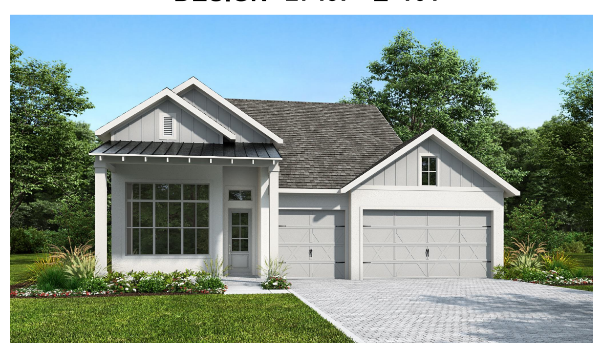
DESIGN 2749F E-102

This design, as originally designed and prior to any changes you make, is estimated to yield approximately the number of square feet shown on page 1. All dimensions are approximate. Square footage may vary based on as-built dimensions, configurations, plan options and/or the method of calculation. Designs are not-to-scale, and are conceptual illustrations that may differ from construction plans or completed improvements. A design may depict features not available on all homesites or in all communities. Perry Homes reserves the right to make changes in plans and specifications, and to substitute material of similar quality. Prices, terms, promotions, plans, dimensions, features, options, amenities, elevations, designs, square footages, specifications, materials, and availability of homes or communities are subject to change without notice or obligation. All obligations will be governed by a written contract. This design does not constitute a commitment to build a particular floor plan or home in any given community Some floor plans, options, and/or elevations may not be available on certain homesites or in a particular community and may require additional charges. Please check with Perry Homes to verify current offerings in the communities are considering. This rendering is the property of Perry Homes. LLC. Any reproduction or exhibition is strictly prohibited @ Perry Homes LLC. 2025