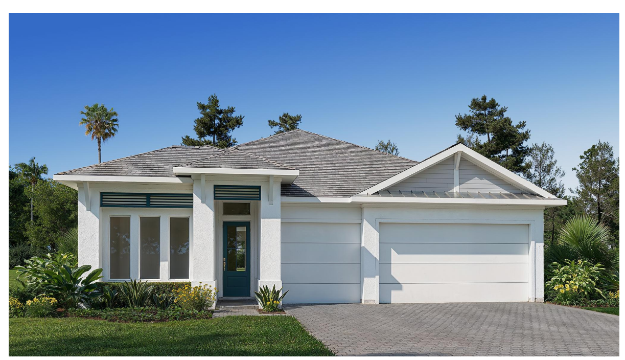
DESIGN 2749F E-50