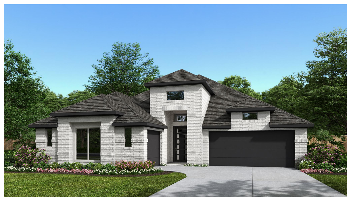
DESIGN 2769W E-1