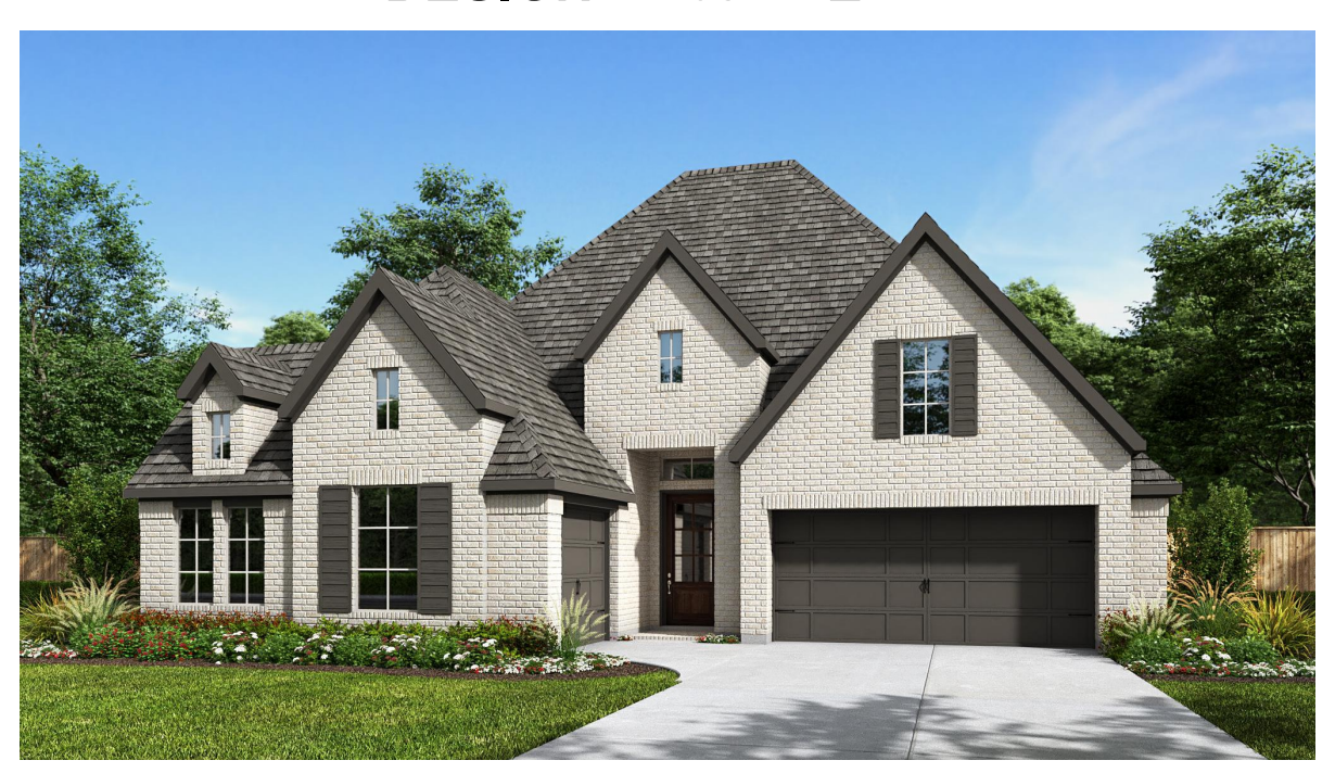
DESIGN 2769W E-50