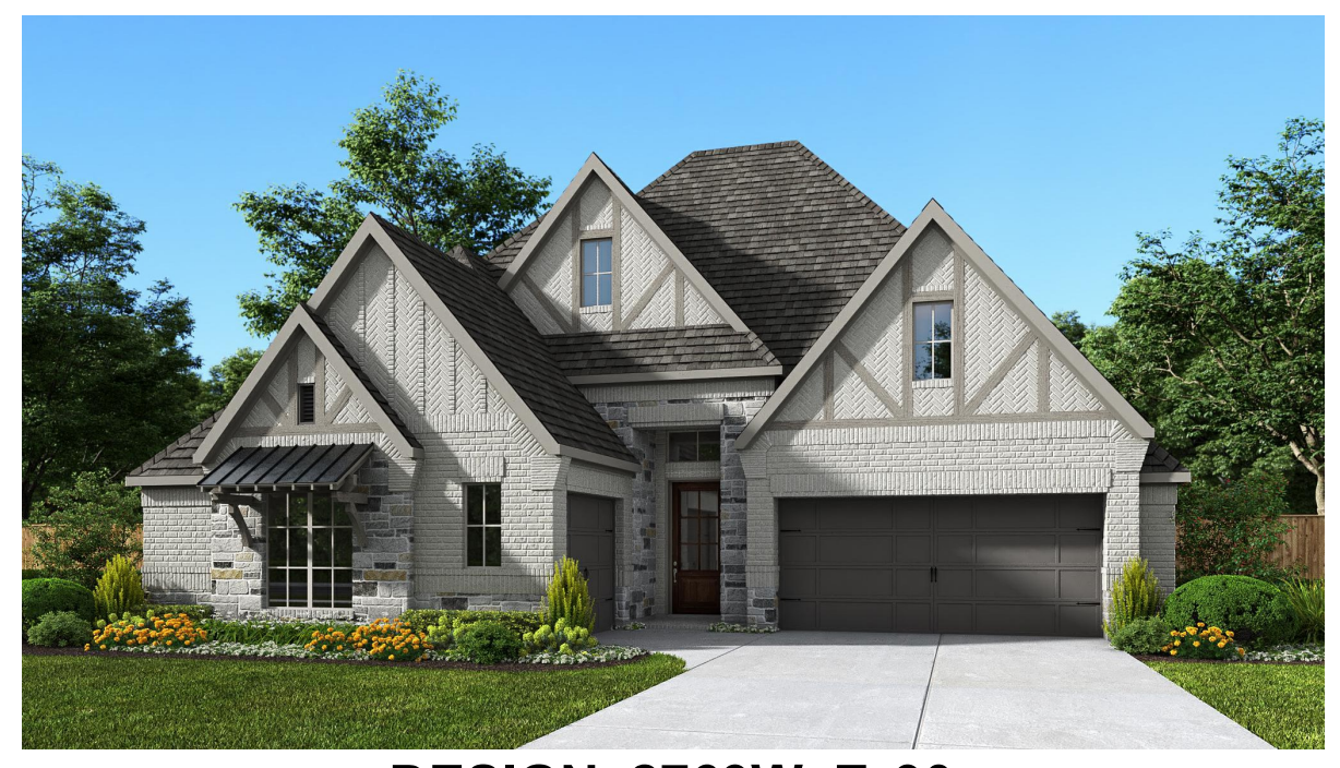
DESIGN 2769W E-90

This design, as originally designed and prior to any changes you make, is estimated to yield approximately the number of square feet shown on page 1. All dimensions are approximate. Square footage may vary based on as-built dimensions, configurations, plan options and/or the method of calculation. Designs are not-to-scale, and are conceptual illustrations that may differ from construction plans or completed improvements. A design may depict features not available on all homesites or in all communities. Perry Homes reserves the right to make changes in plans and specifications, and to substitute material of similar quality. Prices, terms, promotions, plans, dimensions, features, options, amenities, elevations, designs, square footages, specifications, materials, and availability of homes or communities to change without notice or obligation. All obligations will be governed by a written contract. This design does not constitute a commitment to build a particular floor plan or home in any given community. Some floor plans, options, and/or elevations may not be available on certain homesites or in a particular community and may require additional charges. Please check with Perry Homes to verify current offerings in the communities and are considering. This rendering is the property of Perry Homes. LLC. Any reproduction or exhibition is strictly prohibited @ Perry Homes LLC. 2019