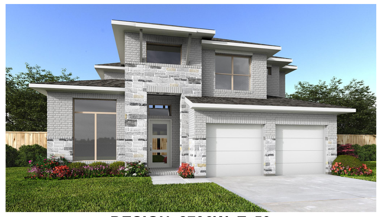
DESIGN 2796W E-50

This design, as originally designed and prior to any changes you make, is estimated to yield approximately the number of square feet shown on page 1. All dimensions are approximate. Square footage may vary based on as-built dimensions, configurations, plan options and/or the method of calculation. Designs are not-to-scale, and are conceptual illustrations that may differ from construction plans or completed improvements. A design may depict features not available on all homesites or in all communities. Perry Homes reserves the right to make changes in plans and specifications, and to substitute material of similar quality. Prices, terms, promotions, plans, dimensions, features, options, amenities, elevations, designs, square footages, specifications, materials, and availability of homes or communities to change without notice or obligation. All obligations will be governed by a written contract. This design does not constitute a commitment to build a particular floor plan or home in any given community. Some floor plans, options, and/or elevations may not be available on certain homesites or in a particular community and may require additional charges. Please check with Perry Homes to verify current offerings in the communities and are considering. This rendering is the property of Perry Homes. LLC. Any reproduction or exhibition is strictly prohibited @ Perry Homes LLC. 2019.