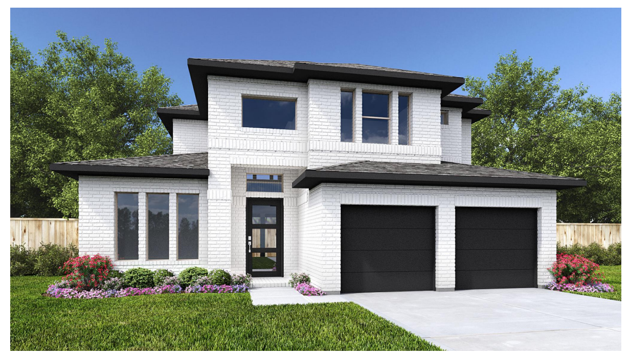
DESIGN 2796W E-1