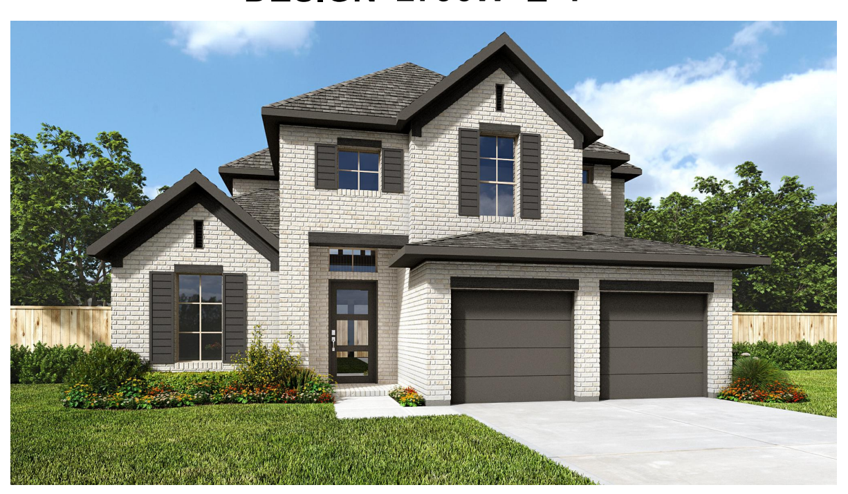
DESIGN 2796W E-30