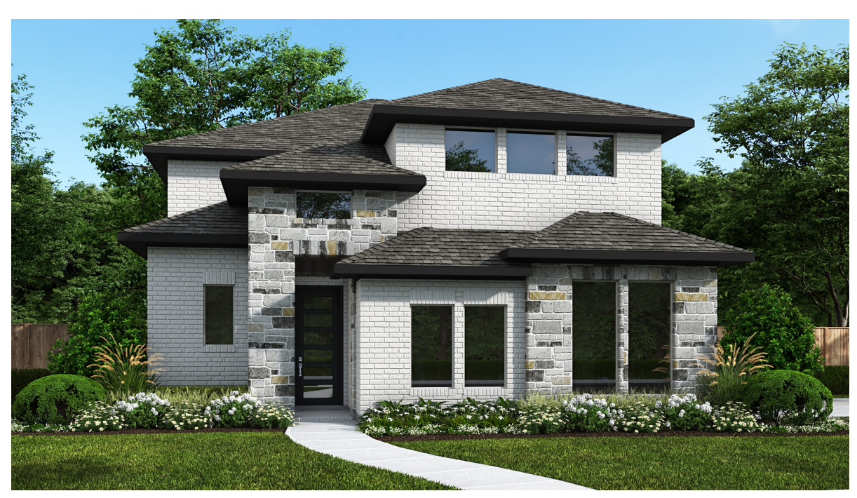
DESIGN 2817H E-1