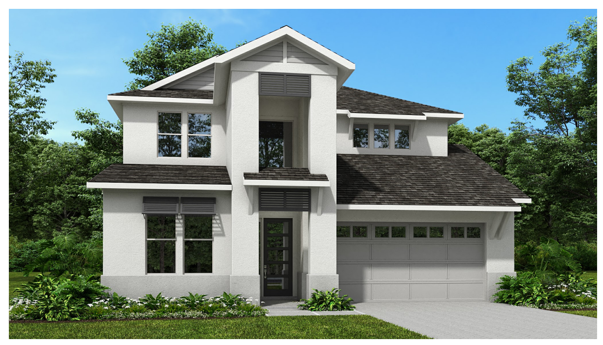
DESIGN 3024F E-30