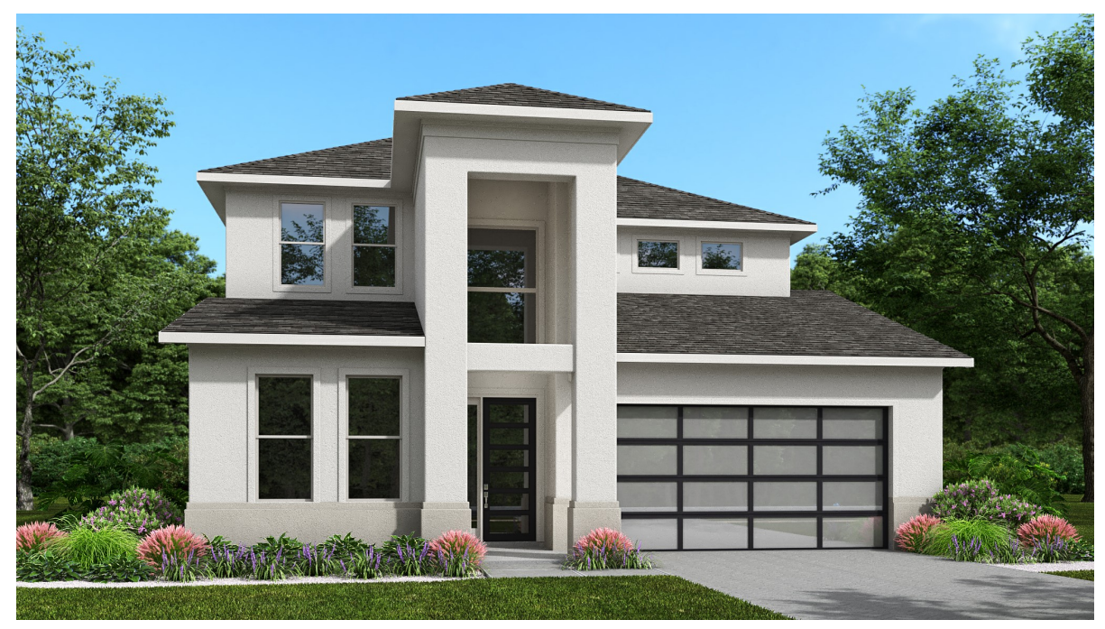
DESIGN 3024F E-1