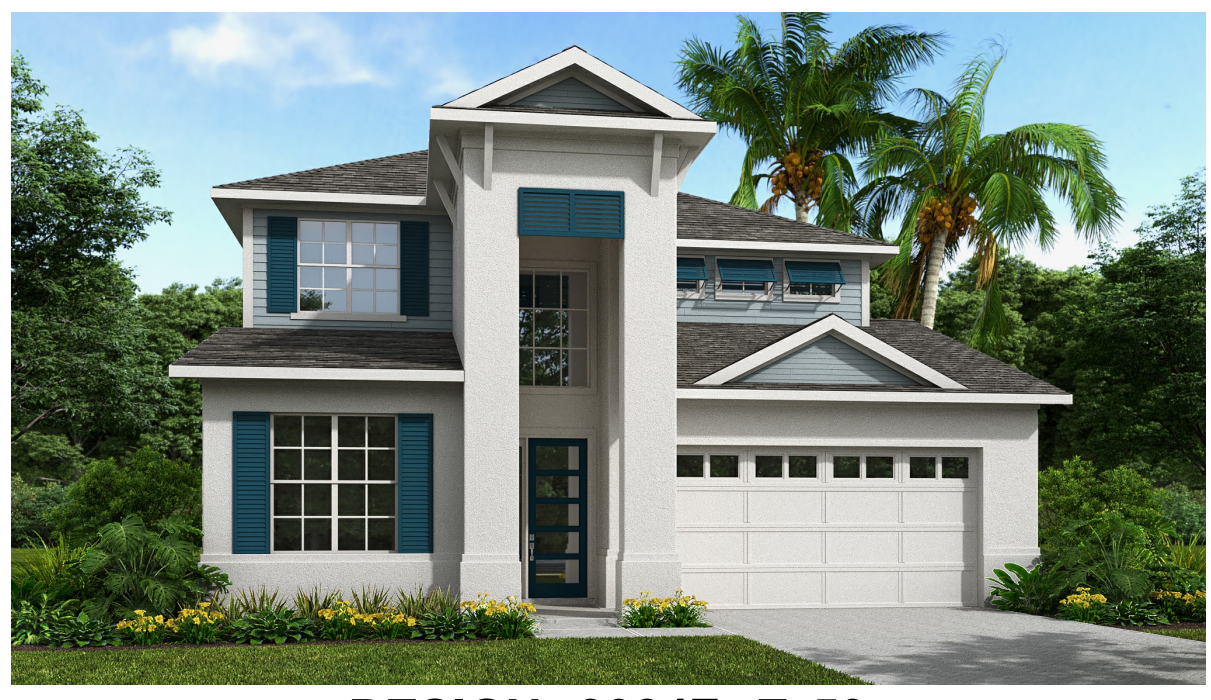
DESIGN 3024F E-50

This design, as originally designed and prior to any changes you make, is estimated to yield approximately the number of square feet shown on page 1. All dimensions are approximate. Square footage may vary based on as-built dimensions, configurations, plan options and/or the method of calculation. Designs are not-to-scale, and are conceptual illustrations that may differ from construction plans or completed improvements. A design may depict features not available on all homesites or in all communities. Perry Homes reserves the right to make changes in plans and specifications, and to substitute material of similar quality. Prices, terms, promotions, plans, dimensions, features, options, amenities, elevations, designs, square footages, specifications, materials, and availability of homes or communities to change without notice or obligation. All obligations will be governed by a written contract. This design does not constitute a commitment to build a particular floor plan or home in any given community. Some floor plans, options, and/or elevations may not be available on certain homesites or in a particular community and may require additional charges. Please check with Perry Homes to verify current offerings in the communities volume considering. This rendering is the property of Perry Homes. LLC. Any reproduction or exhibition is strictly prohibited (@ Perry Homes LLC. 2012).