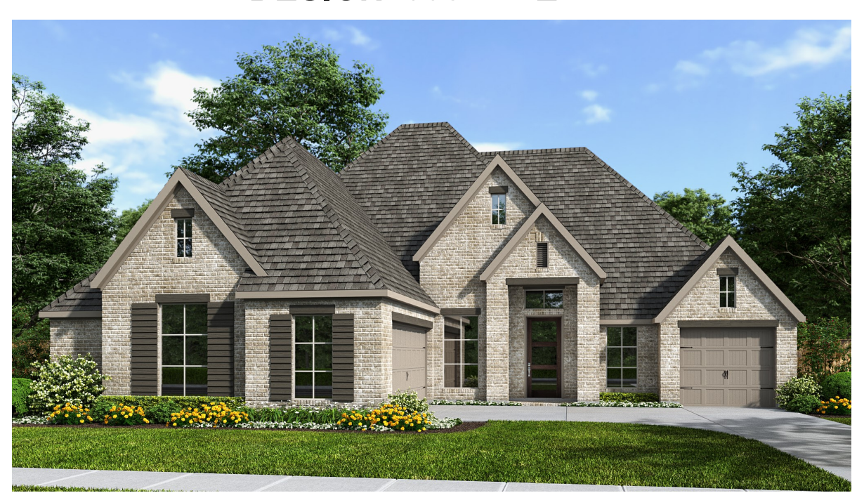
DESIGN 3057W E-30