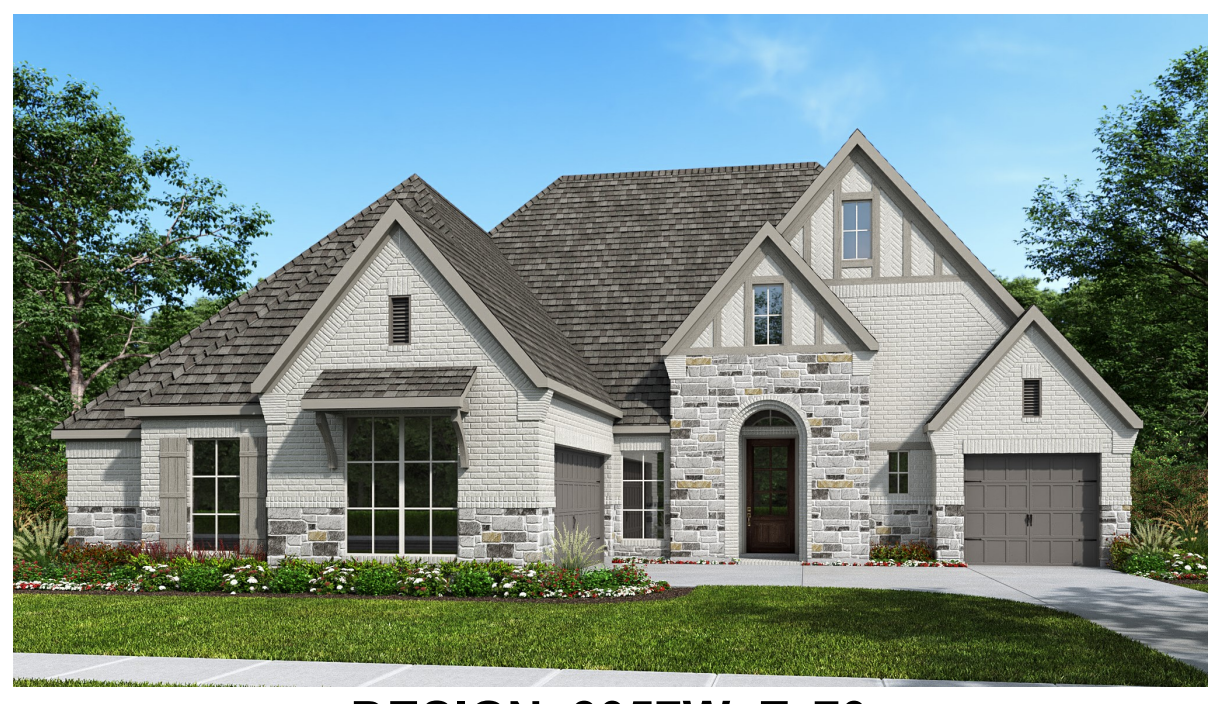
DESIGN 3057W E-70

This design, as originally designed and prior to any changes you make, is estimated to yield approximately the number of square feet shown on page 1. All dimensions are approximate. Square footage may vary based on as-built dimensions, configurations, plan options and/or the method of calculation. Designs are not-to-scale, and are conceptual illustrations that may differ from construction plans or completed improvements. A design may depict features not available on all homesites or in all communities. Perry Homes reserves the right to make changes in plans and specifications, and to substitute material of similar quality. Prices, terms, promotions, plans, dimensions, features, options, amenities, elevations, designs, square footages, specifications, materials, and availability of homes or communities are subject to change without notice or obligation. All obligations will be governed by a written contract. This design does not constitute a commitment to build a particular floor plan or home in any given community Some floor plans, options, and/or elevations may not be available on certain homesites or in a particular community and may require additional charges. Please check with Perry Homes to verify current offerings in the communities you are considering. This rendering is the property of Perry Homes. LLC. Any reproduction or exhibition is strictly prohibited. © Perry Homes. LLC 2024