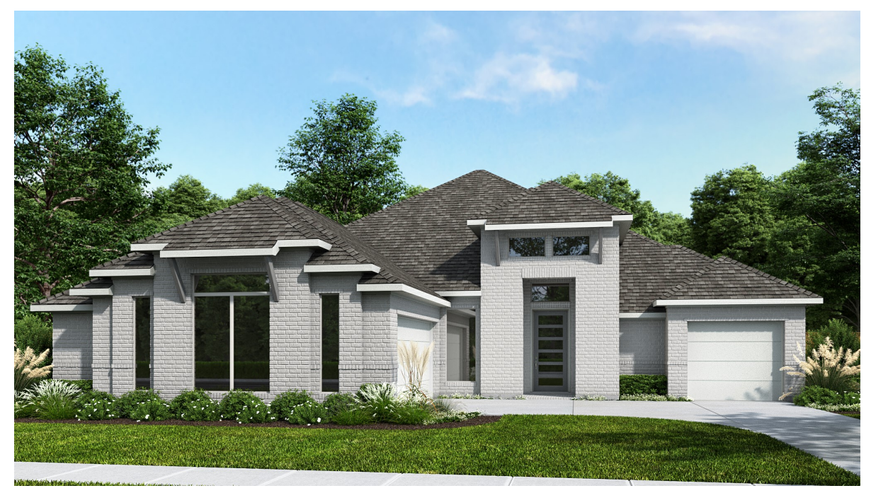
DESIGN 3057W E-1