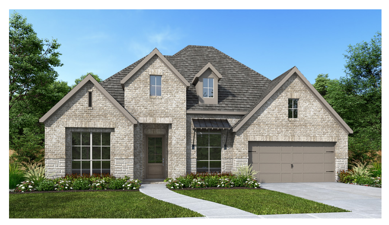
DESIGN 3112P E-1