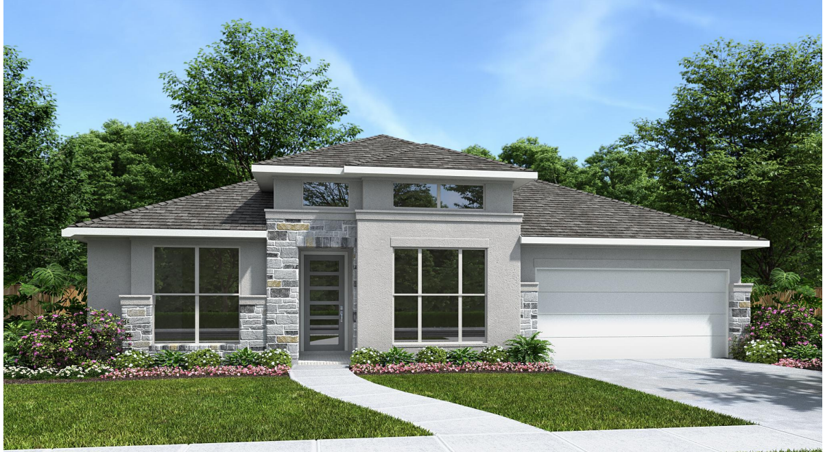
DESIGN 3112P E-2

This design, as originally designed and prior to any changes you make, is estimated to yield approximately the number of square feet shown on page 1. All dimensions are approximate. Square footage may vary based on as-built dimensions, configurations, plan options and/or the method of calculation. Designs are not-to-scale, and are conceptual illustrations that may differ from construction plans or completed improvements. A design may depict features not available on all homesites or in all communities. Perry Homes reserves the right to make changes in plans and specifications, and to substitute material of similar quality. Prices, terms, promotions, plans, dimensions, features, options, amenities, elevations, design does not constitute a committee acommuties are subject to change without notice or obligation. All obligations will be governed by a written contract. This design does not constitute a committee a commutine floor plan or home in any given community. Some floor plans, options, and/or elevations may not be available on certain homesites or in a particular community and require additional charges. Please check with Perry Homes to verify current offerings in the communities you are considering. This rendering is the property of Perry Homes, LLC. Any reproduction or exhibition is strictly prohibited. Perry Homes, LLC 2025