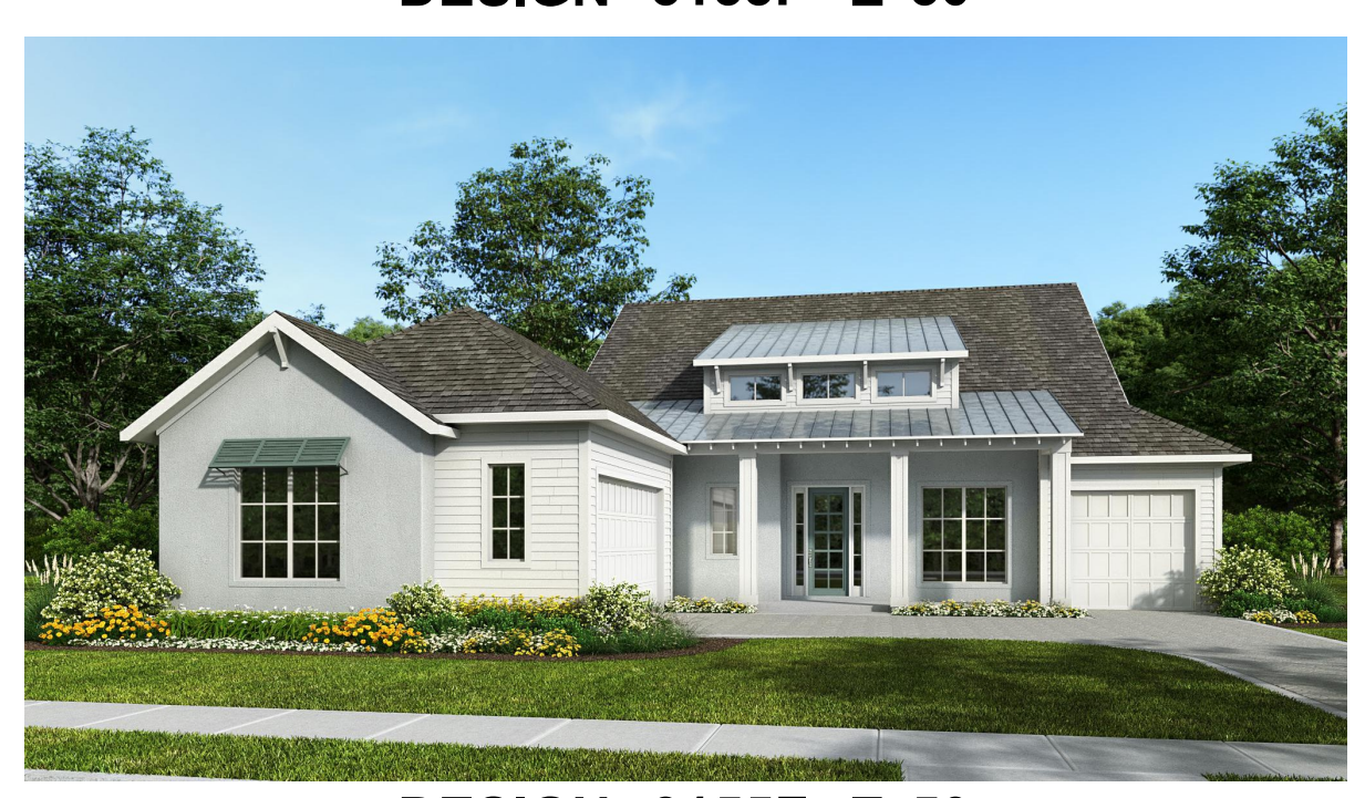
DESIGN 3155F E-50

This design, as originally designed and prior to any changes you make, is estimated to yield approximately the number of square feet shown on page 1. All dimensions are approximate. Square footage may vary based on as-built dimensions, configurations, plan options and/or the method of calculation. Designs are not-to-scale, and are conceptual illustrations that may differ from construction plans or completed improvements. A design may depict features not available on all homesites or in all communities. Perry Homes reserves the right to make changes in plans and specifications, and to substitute material of similar quality. Prices, terms, promotions, plans, dimensions, features, options, amenities, elevations, designs, square footages, specifications, materials, and availability of homes or communities change without notice or obligation. All obligations will be governed by a written contract. This design does not constitute a commitment to build a particular floor plan or home in any given community. Some floor plans, options, and/or elevations may not be available on certain homesites or in a particular community and may require additional charges. Please check with Perry Homes to verify current offerings in the communities you are considering. This rendering is the property of Perry Homes. LLC. Any reproduction or exhibition is strictly prohibited. © Perry Homes. LLC 2025