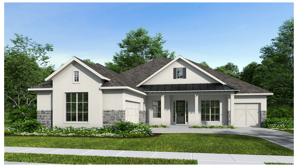
DESIGN 3155F E-1