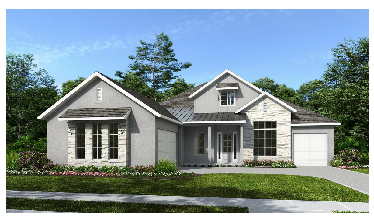
DESIGN 3155F E-30