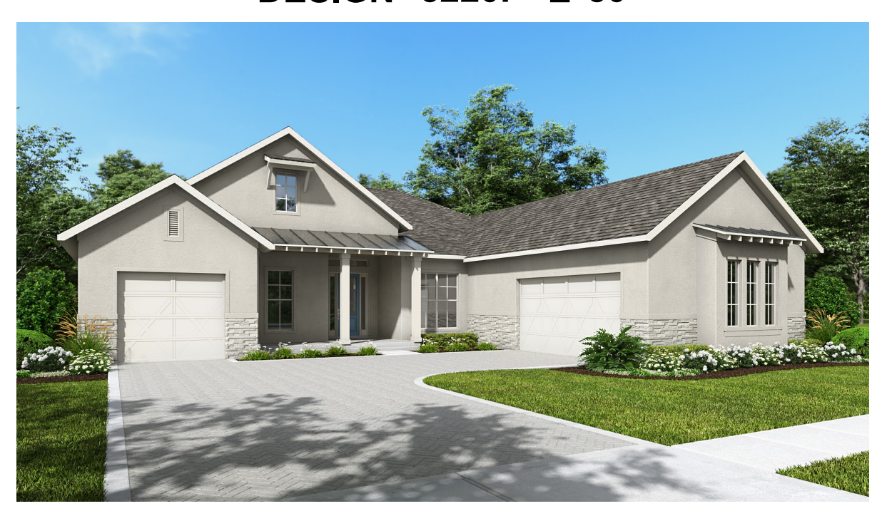
DESIGN 3220F E-70

This design, as originally designed and prior to any changes you make, is estimated to yield approximately the number of square feet shown on page 1. All dimensions are approximate. Square footage may vary based on as-built dimensions, configurations, plan options and/or the method of calculation. Designs are not-to-scale, and are conceptual illustrations that may differ from construction plans or completed improvements. A design may depict features not available on all homesites or in all communities. Perry Homes reserves the right to make changes in plans and specifications, and to substitute material similar quality. Prices, terms, promotions, plans, dimensions, features, options, amenities, elevations, designs, square footages, specifications, materials, and availability of homes or communities evaluate to change without notice or obligation. All obligations will be governed by a written contract. This design does not constitute a commitment to build a particular floor plan or home in any given community. Some floor plans, options, and/or elevations may not be available on certain homesites or in a particular community and may require additional charges. Please check with Perry Homes to verify current offerings in the communities you are considering. This rendering is the property of Perry Homes. LLC. Any reproduction or exhibition is strictly prohibited. © Perry Homes. LLC 2025