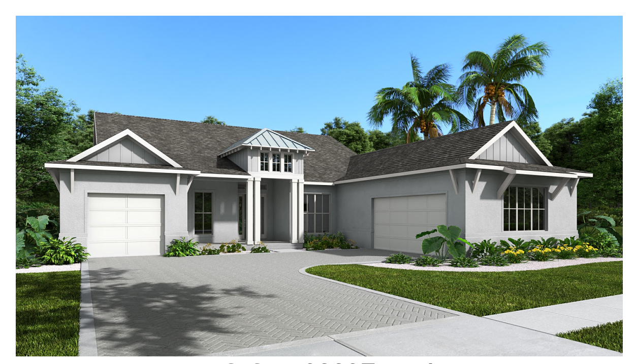
DESIGN 3220F E-1