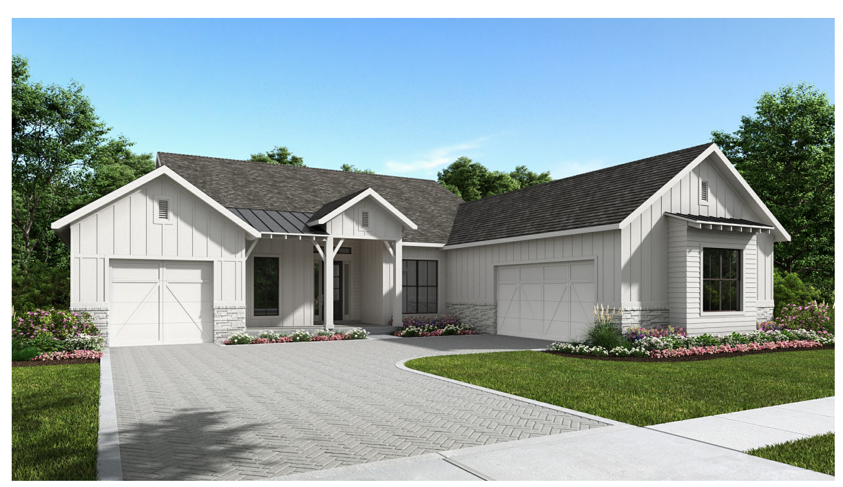
DESIGN 3220F E-50