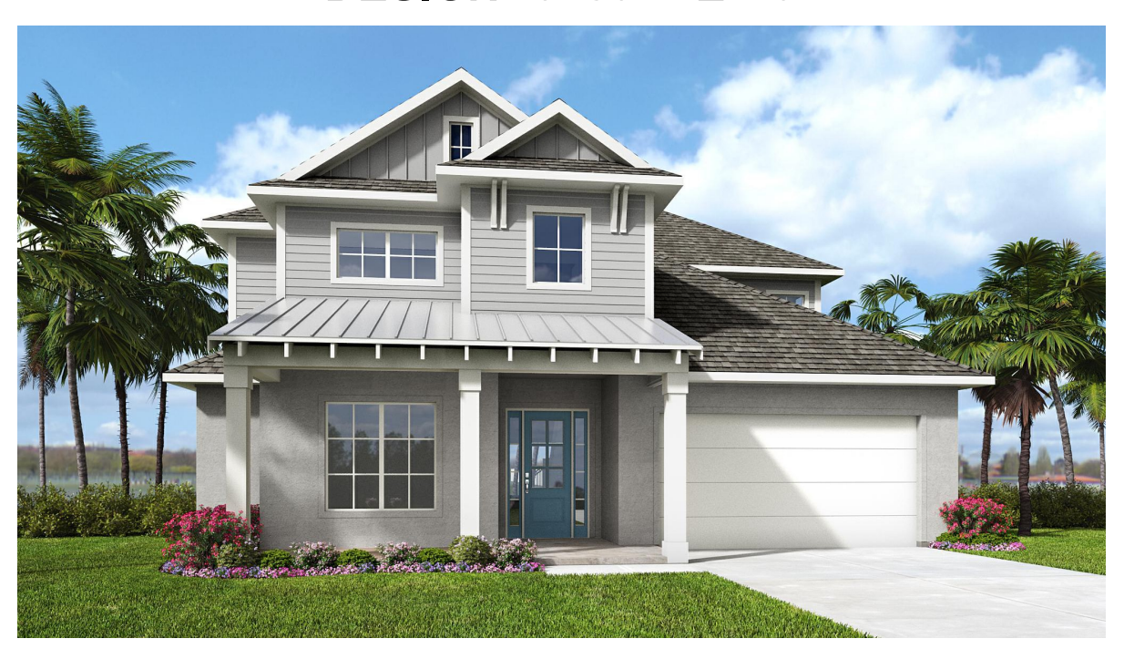
DESIGN 3253F E-90