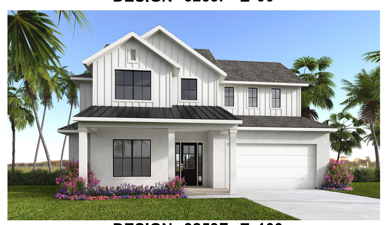
DESIGN 3253F E-100

This design, as originally designed and prior to any changes you make, is estimated to yield approximately the number of square feet shown on page 1. All dimensions are approximate. Square footage may vary based on as-built dimensions, configurations, plan options and/or the method of calculation. Designs are not-to-scale, and are conceptual illustrations that may differ from construction plans or completed improvements. A design may depict features not available on all homesites or in all communities. Perry Homes reserves the right to make changes in plans and specifications, and to substitute material of similar quality. Prices, terms, promotions, plans, dimensions, features, options, amenities, elevations, designs, square footages, specifications, materials, and availability of homes or communities to change without notice or obligation. All obligations will be governed by a written contract. This design does not constitute a commitment to build a particular floor plan or home in any given community. Some floor plans, options, and/or elevations may not be available on certain homesites or in a particular community and may require additional charges. Please check with Perry Homes to verify current offerings in the communities on are considering. This rendering is the property of Perry Homes. LLC. Any reproduction or exhibition is strictly prohibited @ Perry Homes LLC. 2019