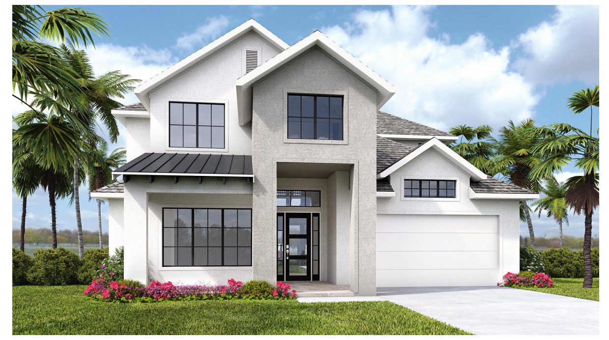
DESIGN 3253F E-70