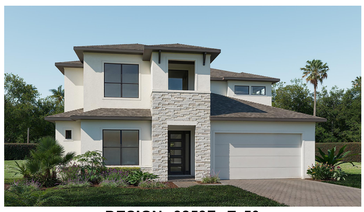
DESIGN 3253F E-50