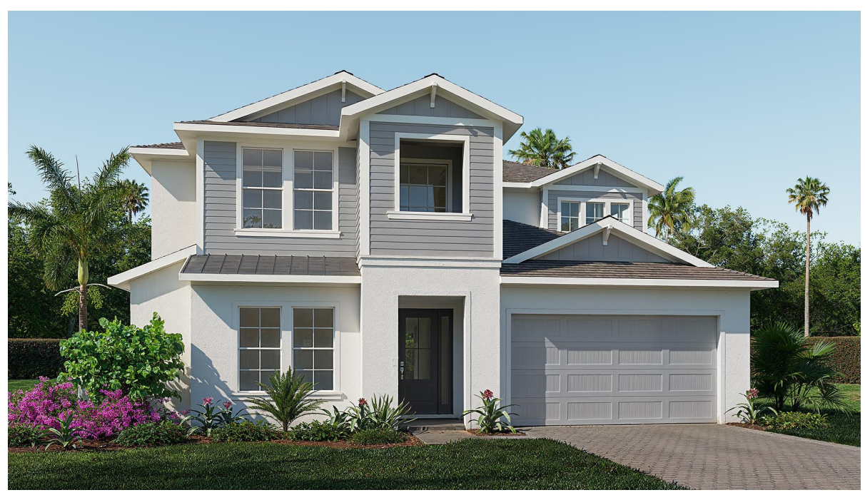
DESIGN 3253F E-30