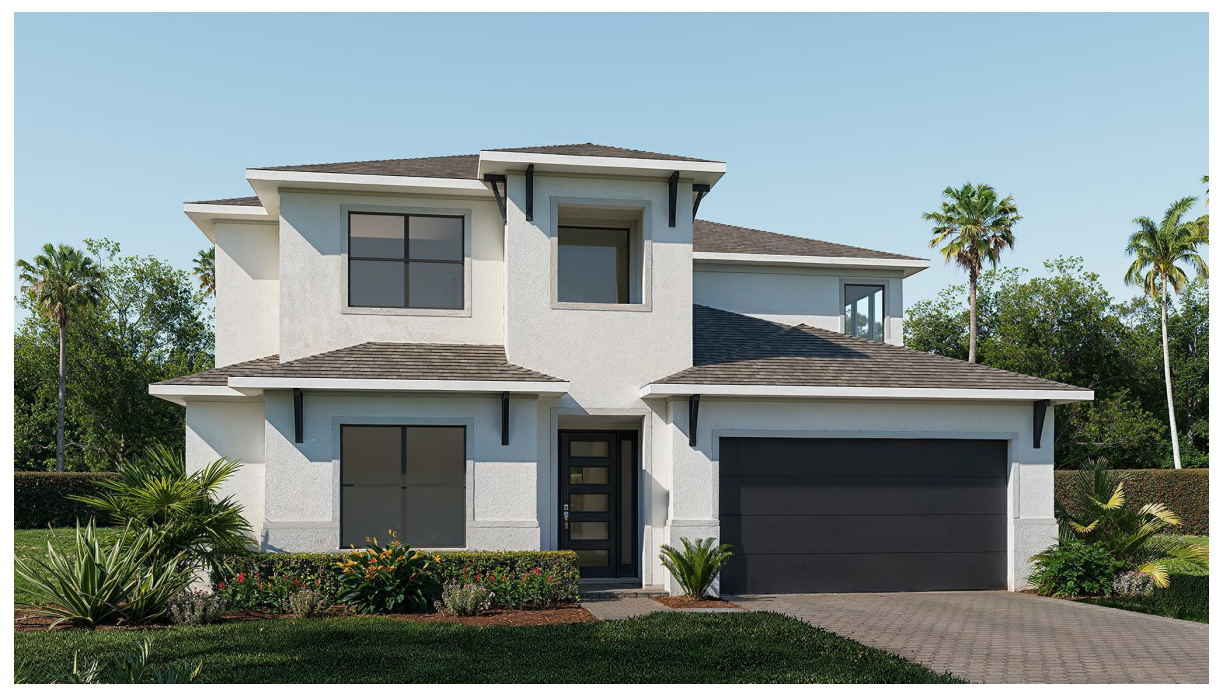
DESIGN 3253F E-1