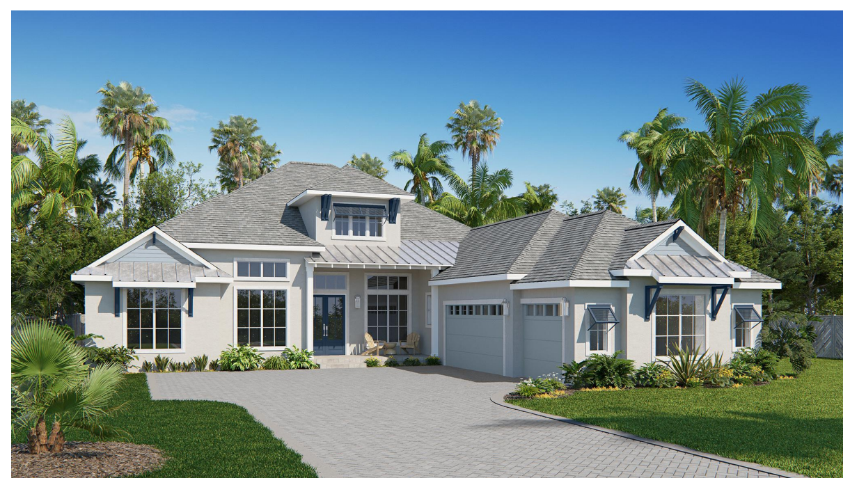
DESIGN 3368F E-1