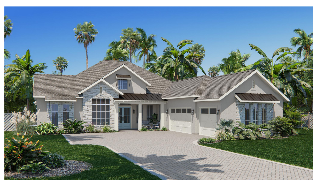
DESIGN 3368F E-2