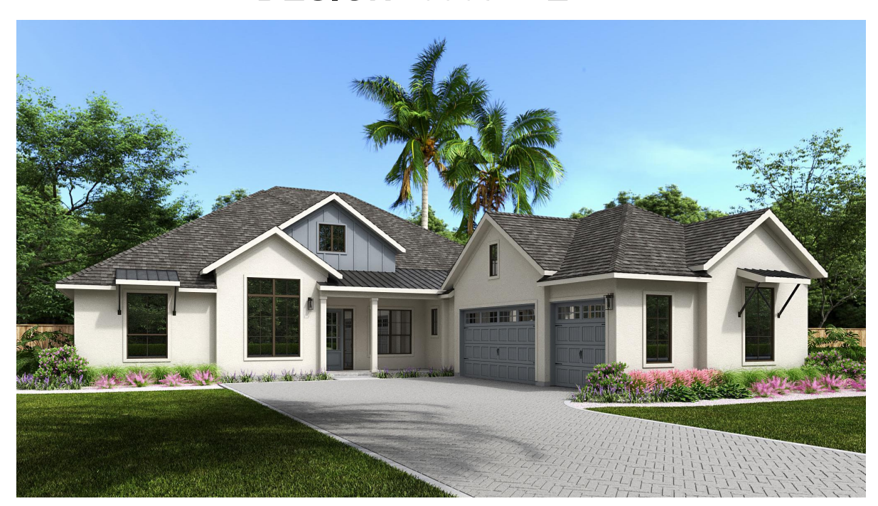
DESIGN 3368F E-5

ranker is estimated to signification solid prior to any charges you make, is estimated to yield approximately the number of square feet shown on page 1. All dimensions are approximate, square rototage may vary based on as-built dimensions, configurations, plan options and/or the method of calculation. Designs are not-to-scale, and are conceptual illustrations that may differ from construction plans or completed improvements. A design may depict features not available on all homesites or in all communities. Perry Homes reserves the right to make changes in plans and specifications, and to substitute material o similar quality. Prices, terms, promotions, plans, dimensions, features, options, amenities, elevations, designs, square footages, specifications, materials, and availability of homes or communities are subject to change without notice or obligation. All obligations will be governed by a written contract. This design does not constitute a commitment to build a particular floor plan or home in any given community. Some floor plans, options, and/or elevations may not be available on certain homesites or in a particular community and may require additional charges. Please check with Perry Homes to verify current offerings in the communities you are considering. This rendering is the property of Perry Homes, LLC. Any reproduction or exhibition is strictly prohibited. © Perry Homes, LLC 2024