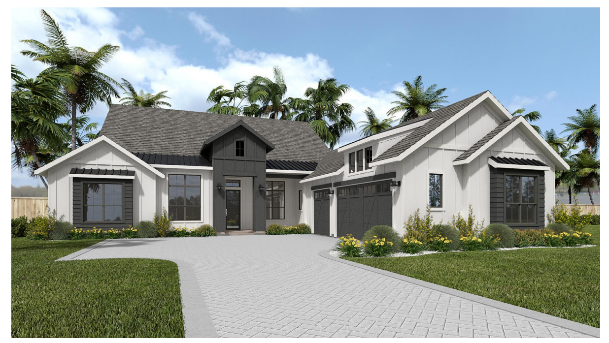
DESIGN 3368F E-4