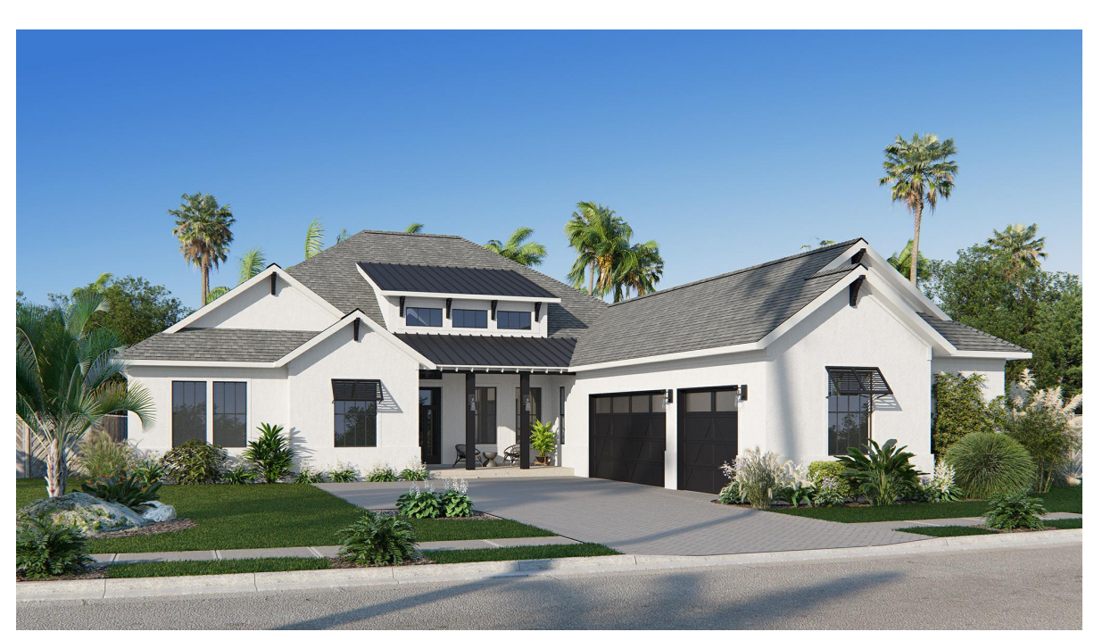
DESIGN 3368F E-3