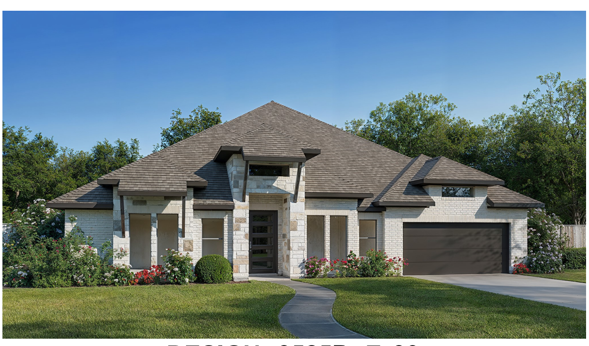
DESIGN 3525P E-30

This design, as originally designed and prior to any changes you make, is estimated to yield approximately the number of square feet shown on page 1. All dimensions are approximate. Square footage may vary based on as-built dimensions, configurations, plan options and/or the method of calculation. Designs are not-to-scale, and are conceptual illustrations that may differ from construction plans or completed improvements. A design may depict features not available on all homesites or in all communities. Perry Homes reserves the right to make changes in plans and specifications, and to substitute material of similar quality. Prices, terms, promotions, plans, dimensions, features, options, amenities, elevations, designs, square footages, specifications, materials, and availability of homes or communities to change without notice or obligation. All obligations will be governed by a written contract. This design does not constitute a commitment to build a particular floor plan or home in any given community. Some floor plans, options, and/or elevations may not be available on certain homesites or in a particular community and may require additional charges. Please check with Perry Homes to verify current offerings in the communities on are considering. This rendering is the property of Perry Homes. LLC. Any reproduction or exhibition is strictly prohibited @ Perry Homes LLC. 2019