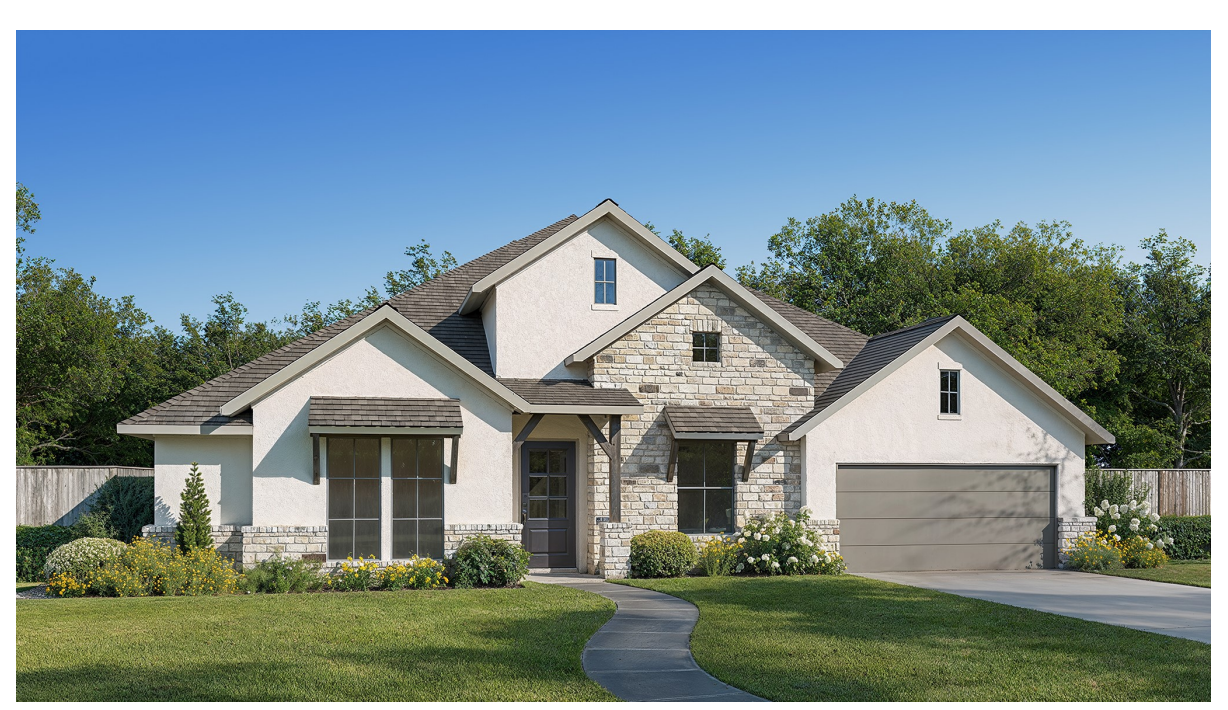
DESIGN 3525P E-1