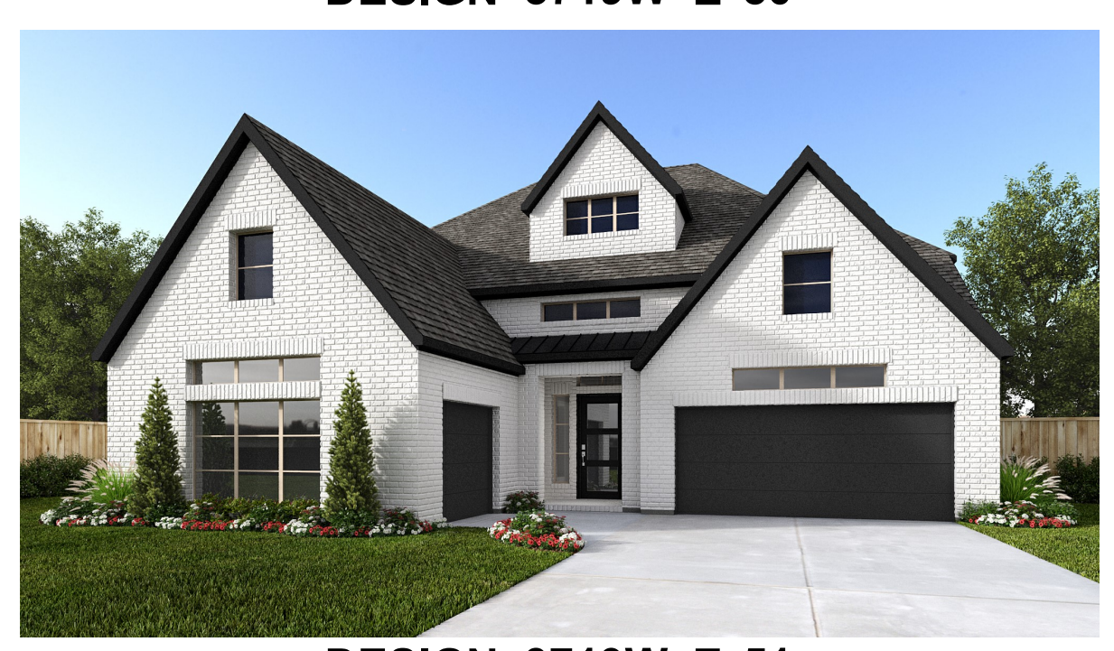
DESIGN 3719W E-51

This design, as originally designed and prior to any changes you make, is estimated to yield approximately the number of square feet shown on page 1. All dimensions are approximate. Square footage may vary based on as-built dimensions, configurations, plan options and/or the method of calculation. Designs are not-to-scale, and are conceptual illustrations that may differ from construction plans or completed improvements. A design may depict features not available on all homesites or in all communities. Perry Homes reserves the right to make changes in plans and specifications, and to substitute material of similar quality. Prices, terms, promotions, plans, dimensions, features, options, amenities, elevations, designs, square footages, specifications, materials, and availability of homes or communities are subject to change without notice or obligation. All obligations will be governed by a written contract. This design does not constitute a commitment to build a particular floor plan or home in any given community Some floor plans, options, and/or elevations may not be available on certain homesites or in a particular community and may require additional charges. Please check with Perry Homes to verify current offerings in the communities are considering. This rendering is the property of Perry Homes. LLC. Any reproduction or exhibition is strictly prohibited @ Perry Homes LLC. 2024