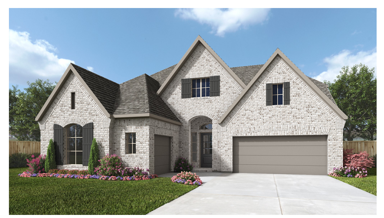
DESIGN 3719W E-1