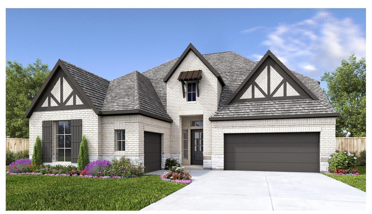
DESIGN 3719W E-50