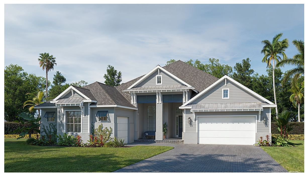
DESIGN 3741F E-1