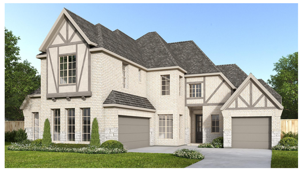
DESIGN 3774W E-50

This design, as originally designed and prior to any changes you make, is estimated to yield approximately the number of square feet shown on page 1. All dimensions are approximate. Square footage may vary based on as-built dimensions, configurations, plan options and/or the method of calculation. Designs are not-to-scale, and are conceptual illustrations that may differ from construction plans or completed improvements. A design may depict features not available on all homesites or in all communities. Perry Homes reserves the right to make changes in plans and specifications, and to substitute material of similar quality. Prices, terms, promotions, plans, dimensions, features, options, amenities, elevations, designs, square footages, specifications, materials, and availability of homes or communities are subject to change without notice or obligation. All obligations will be governed by a written contract. This design does not constitute a commitment to build a particular floor plan or home in any given community of the property of perry Homes. LLC and may require additional charges. Please check with Perry Homes to verify current offerings in the communities you are considering. This rendering is the property of Perry Homes. LLC. Any reproduction or exhibition is strictly prohibited. © Perry Homes. LLC 2024