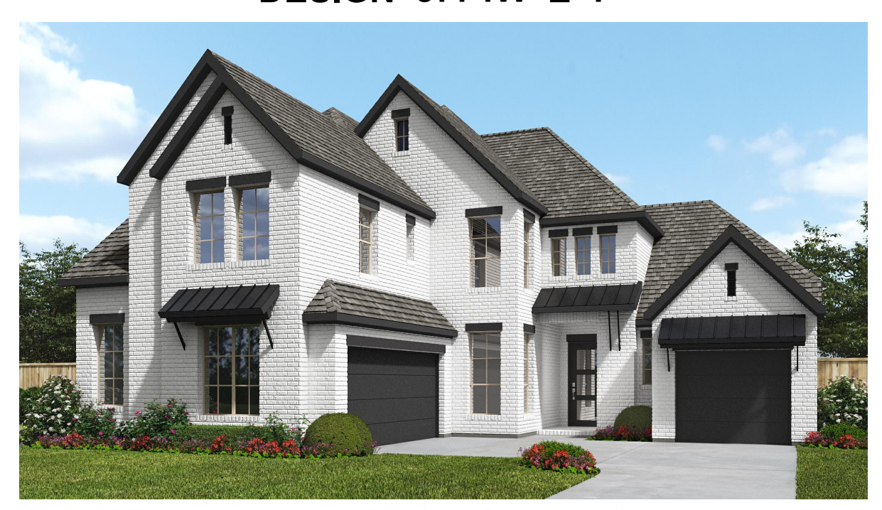
DESIGN 3774W E-30