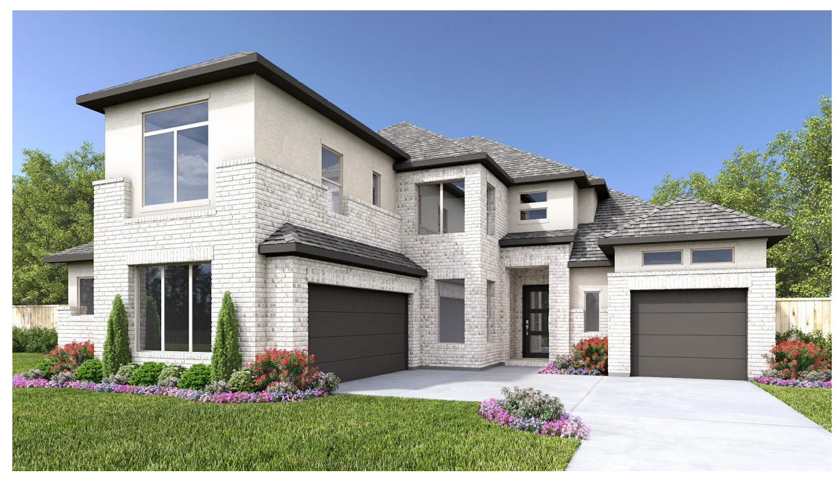
DESIGN 3774W E-1