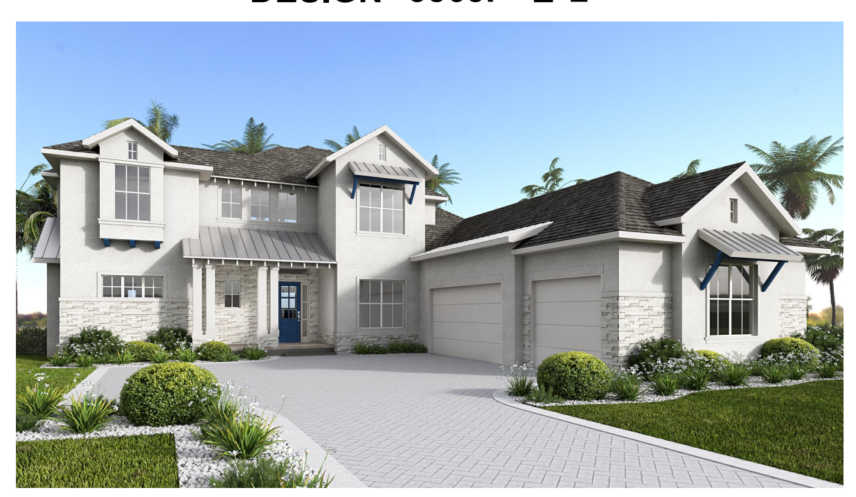
DESIGN 3865F E-3

This design, as originally designed and prior to any changes you make, is estimated to yield approximately the number of square feet shown on page 1. All dimensions are approximate. Square footage may vary based on as-built dimensions, configurations, plan options and/or the method of calculation. Designs are not-to-scale, and are conceptual illustrations that may differ from construction plans or completed improvements. A design may depict features not available on all homesites or in all communities. Perry Homes reserves the right to make changes in plans and specifications, and to substitute material of similar quality. Prices, terms, promotions, plans, dimensions, features, options, amenities, elevations, designs, square footages, specifications, materials, and availability of homes or communities are subject to change without notice or obligation. All obligations will be governed by a written contract. This design does not constitute a commitment to build a particular floor plan or home in any given community of the property of perry Homes. LLC and may require additional charges. Please check with Perry Homes to verify current offerings in the communities you are considering. This rendering is the property of Perry Homes. LLC. Any reproduction or exhibition is strictly prohibited. © Perry Homes. LLC 2025