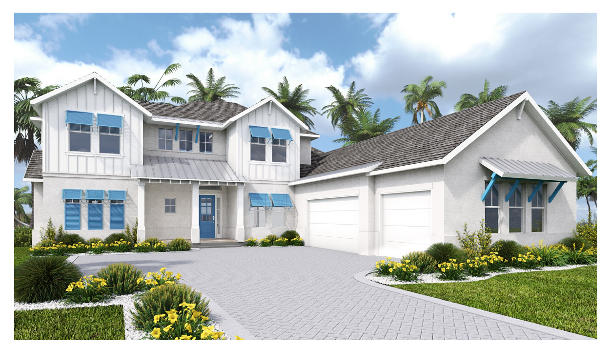
DESIGN 3865F E-1