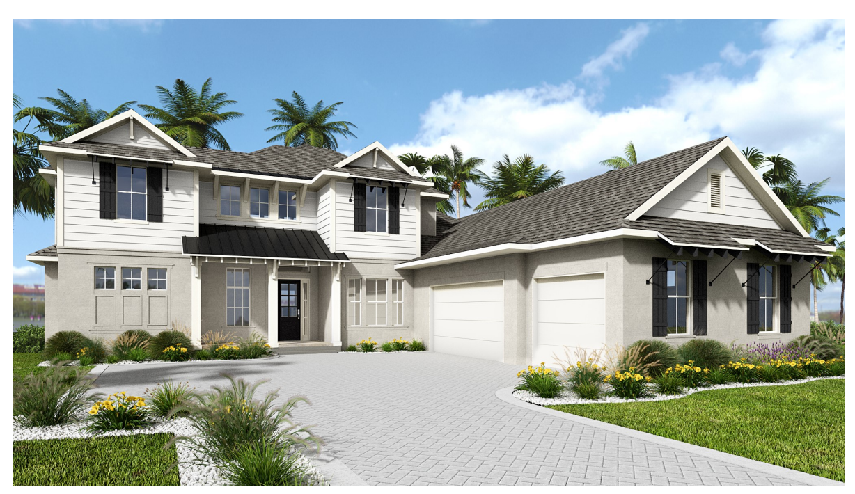
DESIGN 3865F E-2