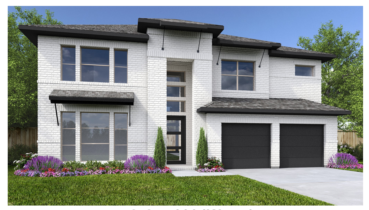
DESIGN 3994W E-1