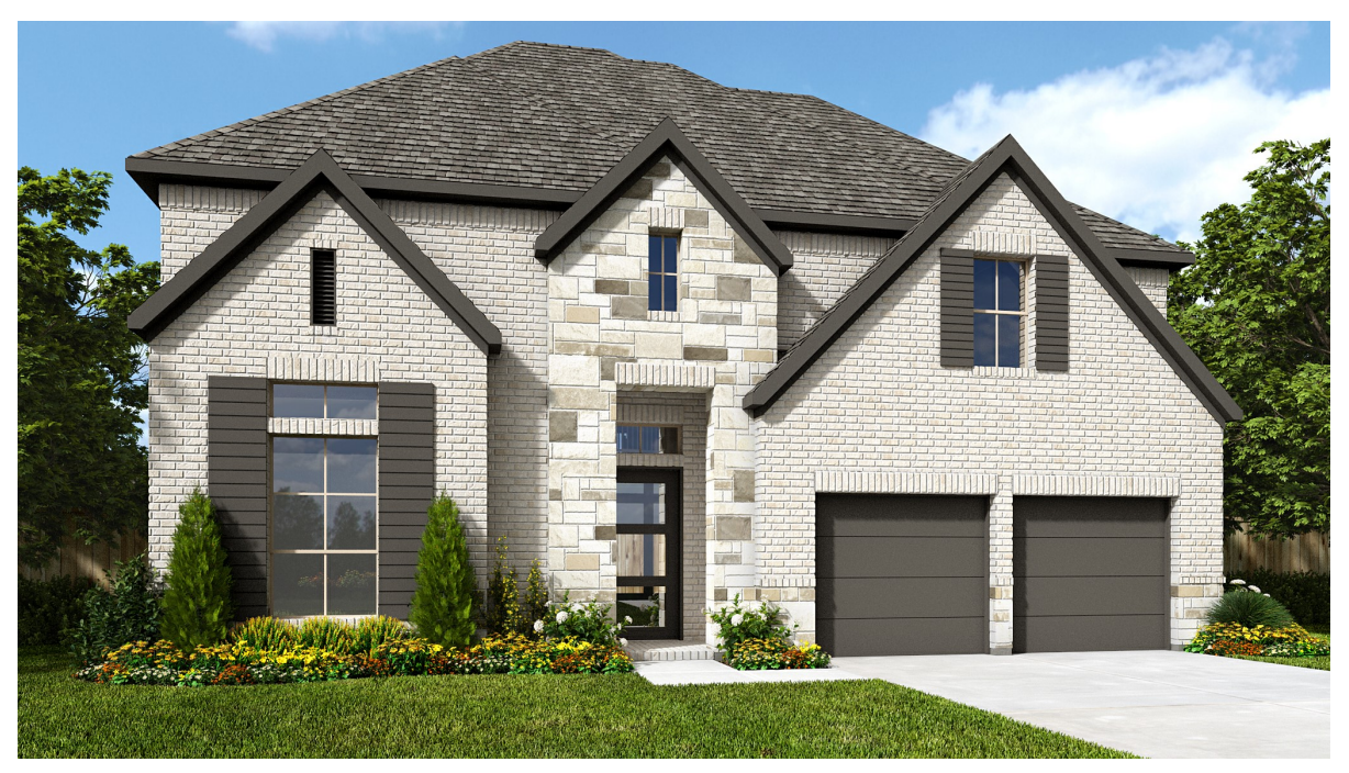
DESIGN 3994W E-30