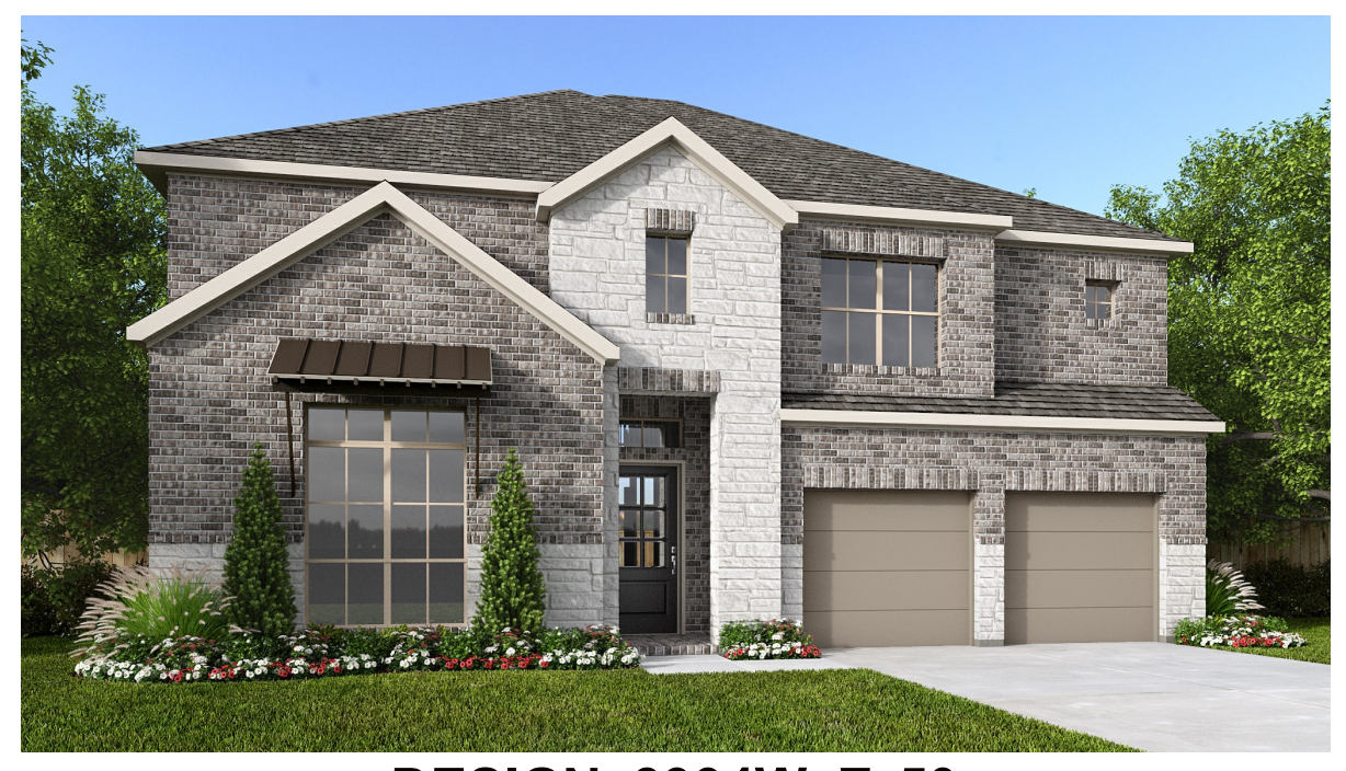
DESIGN 3994W E-50

This design, as originally designed and prior to any changes you make, is estimated to yield approximately the number of square feet shown on page 1. All dimensions are approximate. Square footage may vary based on as-built dimensions, configurations, plan options and/or the method of calculation. Designs are not-to-scale, and are conceptual illustrations that may differ from construction plans or completed improvements. A design may depict features not available on all homesites or in all communities. Perry Homes reserves the right to make changes in plans and specifications, and to substitute material of similar quality. Prices, terms, promotions, plans, dimensions, features, options, amenities, elevations, designs, square footages, specifications, materials, and availability of homes or communities are subject to change without notice or obligation. All obligations will be governed by a written contract. This design does not constitute a commitment to build a particular floor plan or home in any given community Some floor plans, options, and/or elevations may not be available on certain homesites or in a particular community and may require additional charges. Please check with Perry Homes to verify current offerings in the communities are considering. This rendering is the property of Perry Homes. LLC. Any reproduction or exhibition is strictly prohibited @ Perry Homes LLC. 2024