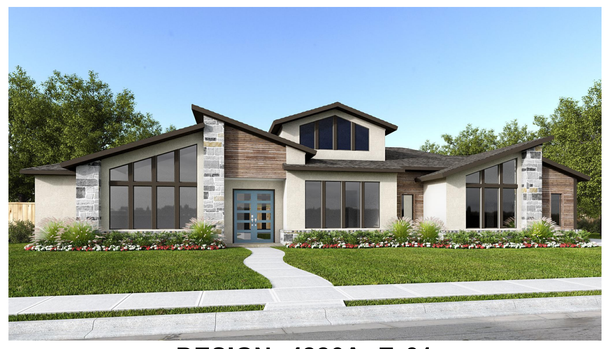
DESIGN 4226A E-31

This design, as originally designed and prior to any changes you make, is estimated to yield approximately the number of square feet shown on page 1. All dimensions are approximate. Square footage may vary based on as-built dimensions, configurations, plan options and/or the method of calculation. Designs are not-to-scale, and are conceptual illustrations that may differ from construction plans or completed improvements. A design may depict features not available on all homesites or in all communities. Perry Homes reserves the right to make changes in plans and specifications, and to substitute material of similar quality. Prices, terms, promotions, plans, dimensions, features, options, amenities, elevations, designs, square footages, specifications, materials, and availability of homes or communities are subject to change without notice or obligation. All obligations will be governed by a written contract. This design does not constitute a commitment to build a particular floor plan or home in any given community Some floor plans, options, and/or elevations may not be available on certain homesites or in a particular community and may require additional charges. Please check with Perry Homes to verify current offerings in the communities you are considering. This rendering is the property of Perry Homes. LLC. Any reproduction or exhibition is strictly prohibited. © Perry Homes. LLC 2025