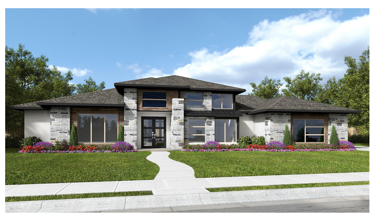
DESIGN 4226A E-30