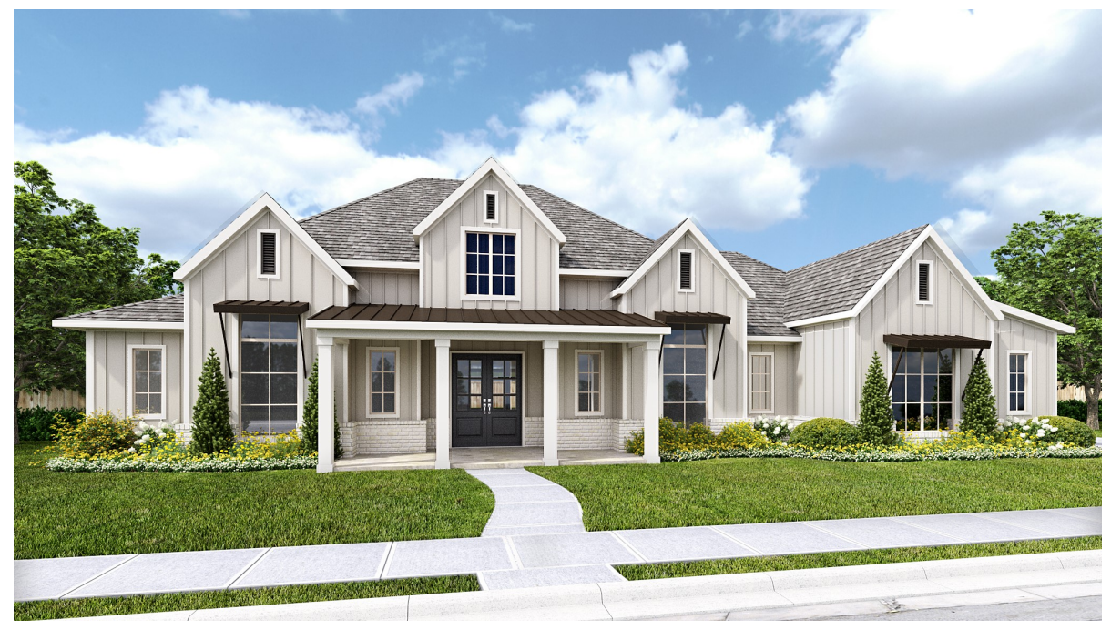
DESIGN 4226A E-1