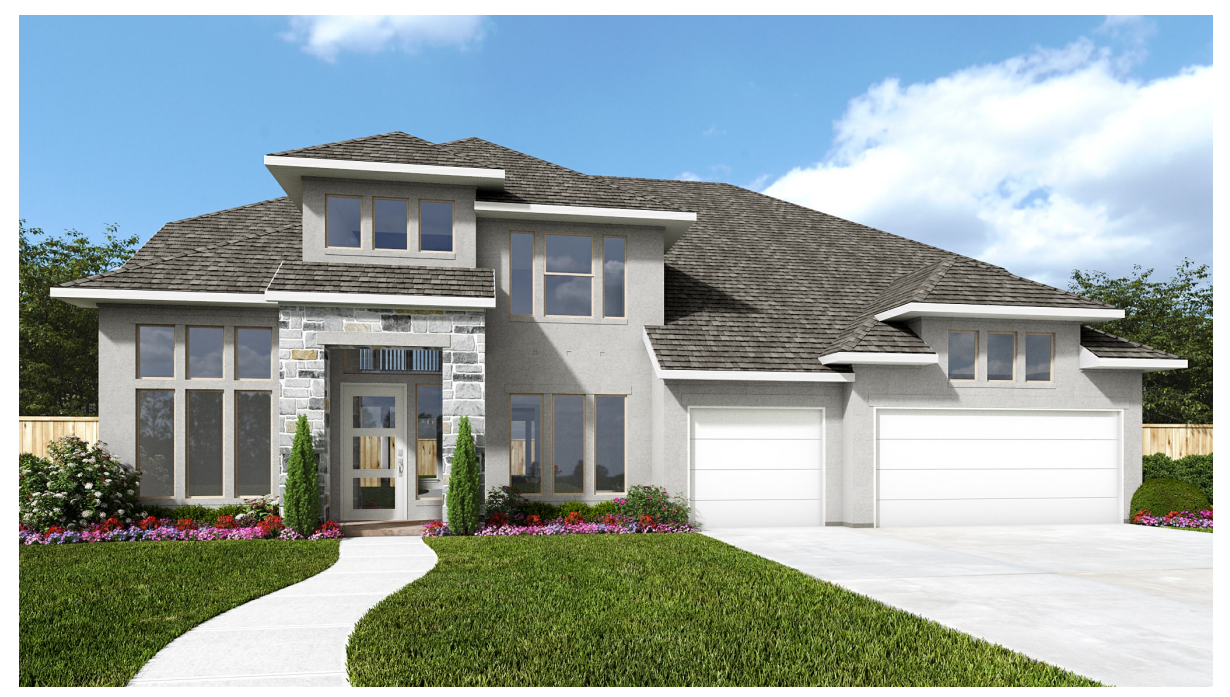
DESIGN 4285S E-1