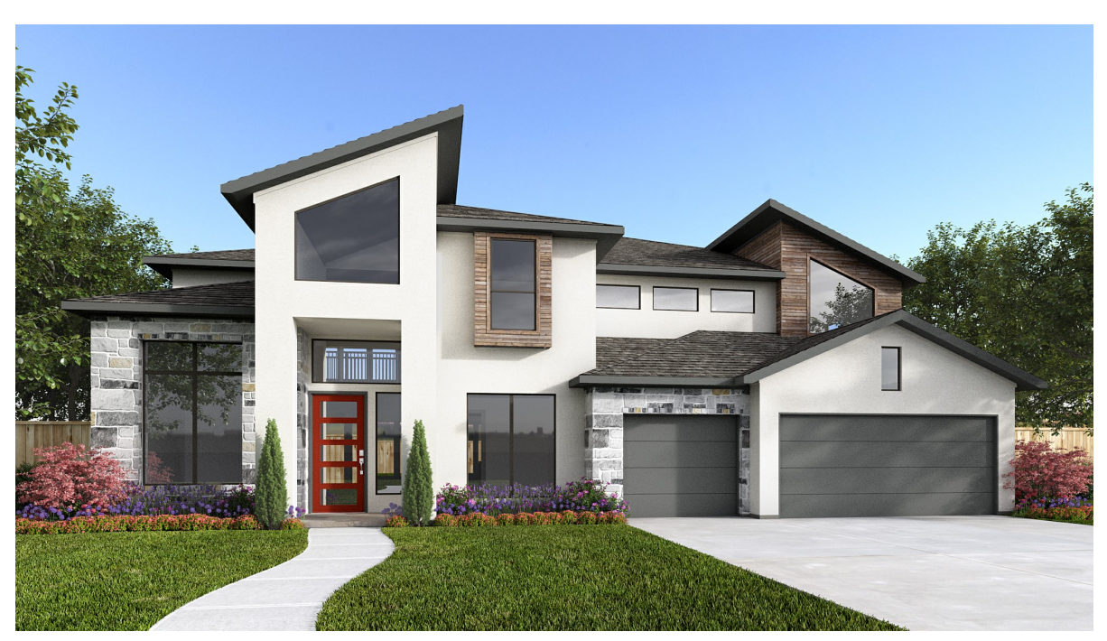
DESIGN 4285S E-30