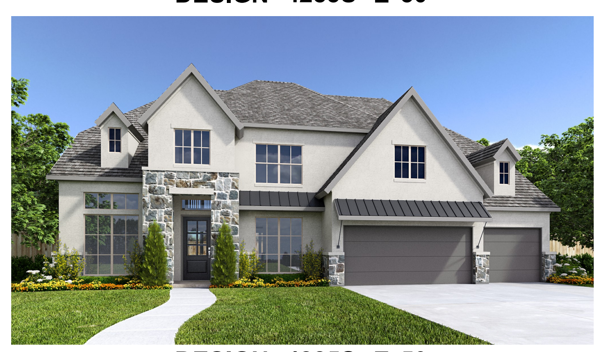
DESIGN 4285S E-50

This design, as originally designed and prior to any changes you make, is estimated to yield approximately the number of square feet shown on page 1. All dimensions are approximate. Square footage may vary based on as-built dimensions, configurations, plan options and/or the method of calculation. Designs are not-to-scale, and are conceptual illustrations that may differ from construction plans or completed improvements. A design may depict features not available on all homesites or in all communities. Perry Homes reserves the right to make changes in plans and specifications, and to substitute material of similar quality. Prices, terms, promotions, plans, dimensions, features, options, amenities, elevations, designs, square footages, specifications, materials, and availability of homes or communities to change without notice or obligation. All obligations will be governed by a written contract. This design does not constitute a commitment to build a particular floor plan or home in any given community. Some floor plans, options, and/or elevations may not be available on certain homesites or in a particular community and may require additional charges. Please check with Perry Homes to verify current offerings in the communities and are considering. This rendering is the property of Perry Homes. LLC. Any reproduction or exhibition is strictly prohibited @ Perry Homes LLC. 2019