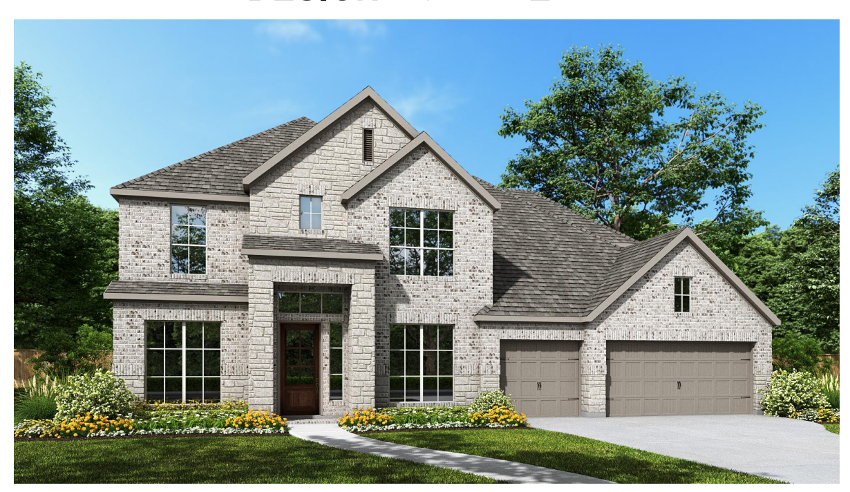
DESIGN 4347W E-30