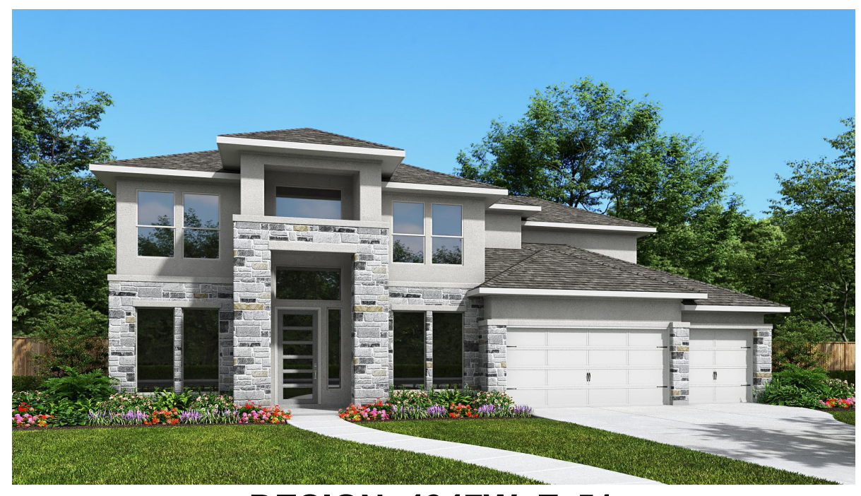
DESIGN 4347W E-51

This design, as originally designed and prior to any changes you make, is estimated to yield approximately the number of square feet shown on page 1. All dimensions are approximate. Square footage may vary based on as-built dimensions, configurations, plan options and/or the method of calculation. Designs are not-to-scale, and are conceptual illustrations that may differ from construction plans or completed improvements. A design may depict features not available on all homesites or in all communities. Perry Homes reserves the right to make changes in plans and specifications, and to substitute material of similar quality. Prices, terms, promotions, plans, dimensions, features, options, amenities, elevations, designs, square footages, specifications, materials, and availability of homes or communities are subject to change without notice or obligation. All obligations will be governed by a written contract. This design does not constitute a commitment to build a particular floor plan or home in any given community. Some floor plans, and/or elevations may not be available on certain homesites or in a particular community and may require additional charges. Please check with Perry Homes to verify current offerings in the communities you are considering. This rendering is the property of Perry Homes, LLC. Any reproduction or exhibition is strictly prohibited. © Perry Homes, LLC 2024