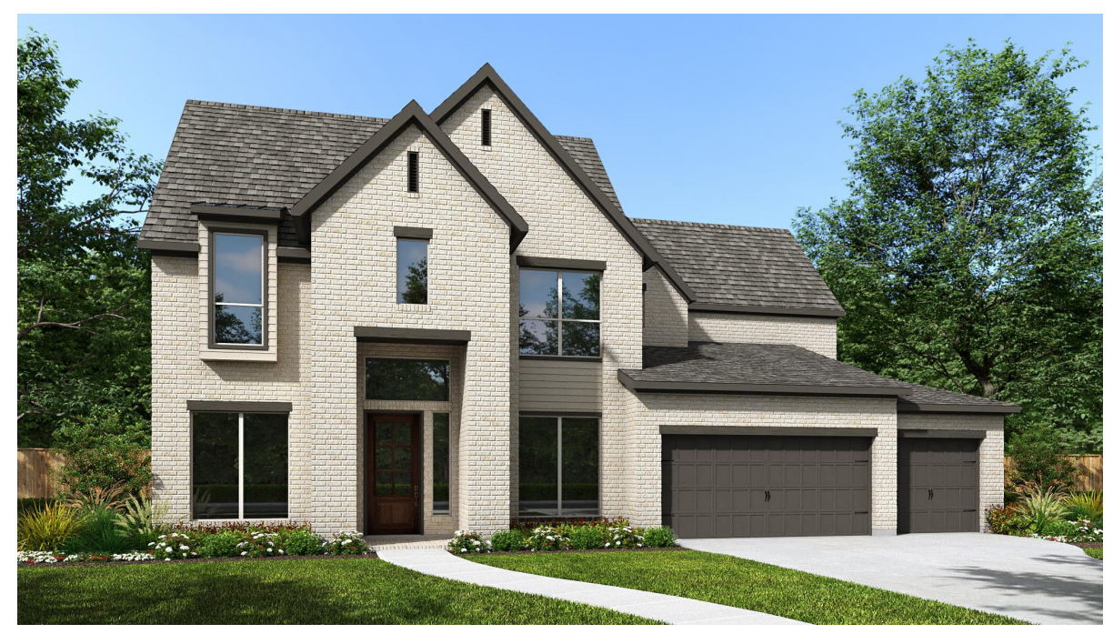
DESIGN 4347W E-1